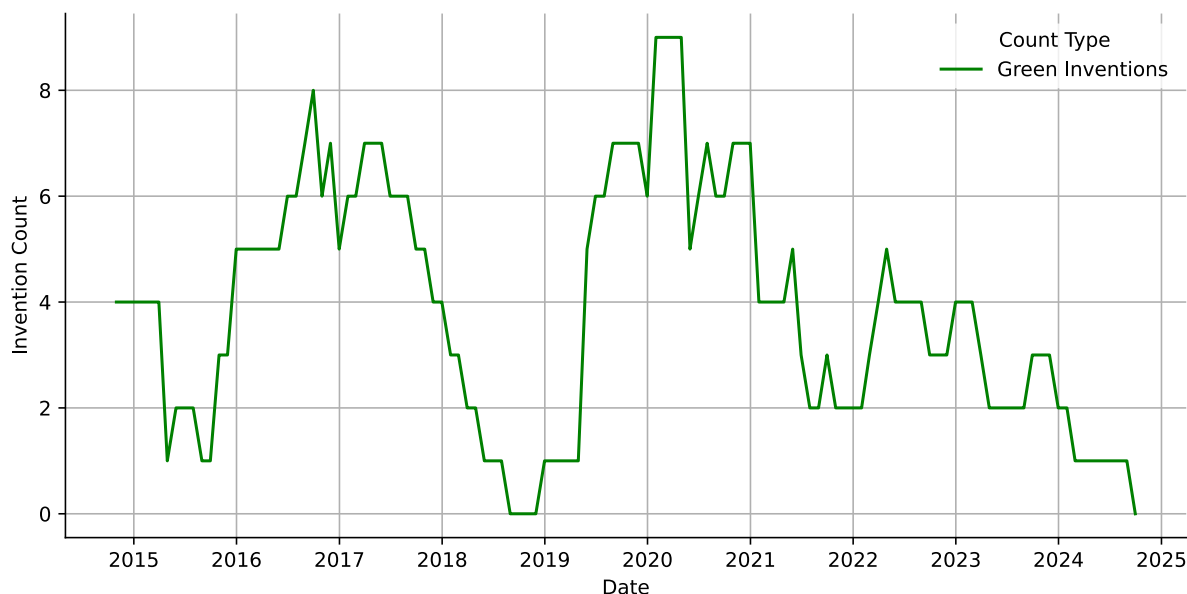
Rolling 1-Year Invention Count

The graph above illustrates the number of green inventions published by the company over the past decade. Data is presented monthly, with each point representing the total green invention count for the preceding 12 months.