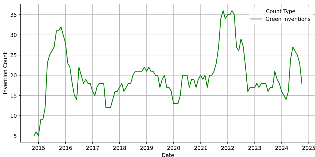
Rolling 1-Year Invention Count

The graph above illustrates the number of green inventions published by the company over the past decade. Data is presented monthly, with each point representing the total green invention count for the preceding 12 months.