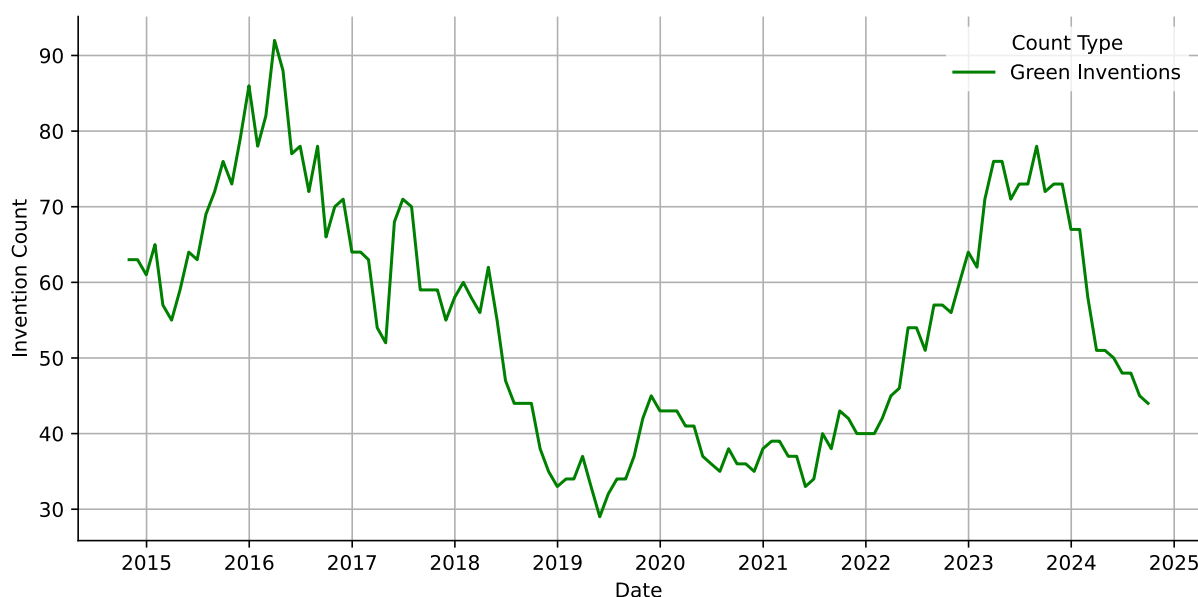
Rolling 1-Year Invention Count

The graph above illustrates the number of green inventions published by the company over the past decade. Data is presented monthly, with each point representing the total green invention count for the preceding 12 months.