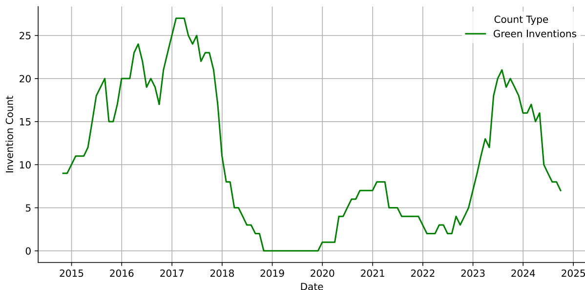
Rolling 1-Year Invention Count

The graph above illustrates the number of green inventions published by the company over the past decade. Data is presented monthly, with each point representing the total green invention count for the preceding 12 months.