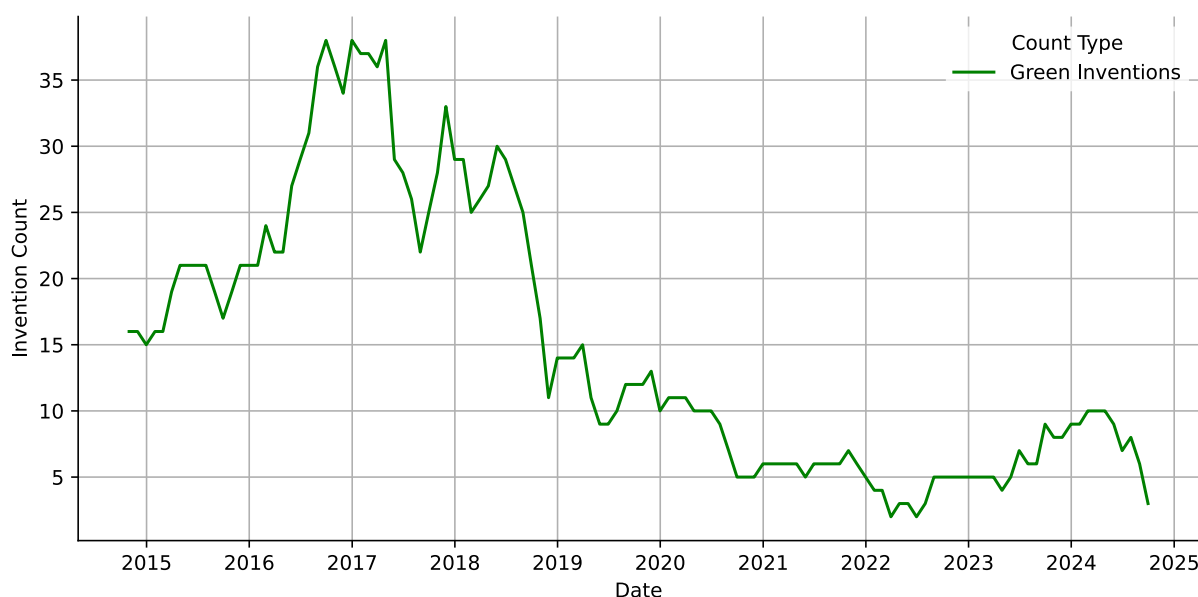
Rolling 1-Year Invention Count

The graph above illustrates the number of green inventions published by the company over the past decade. Data is presented monthly, with each point representing the total green invention count for the preceding 12 months.