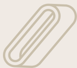
LEAN Resistance Bands (Adjustable or HIIT)