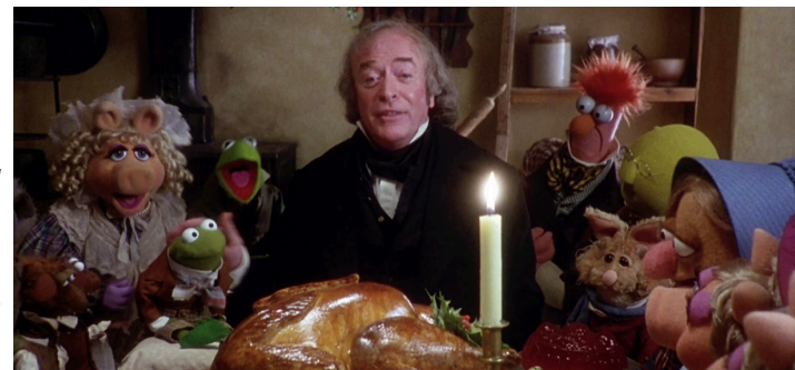
Michael Caine plays it straight in 1992's delightful A Muppet Christmas Carol .

Dickens' story of rehabilitation and redemption is one we return to again and again, perhaps because it holds the promise of Christmas as a season of rebirth and a reminder to always hold Christmas in our hearts. It is being retold, both for the first time and again, in this brand-new adaptation at Alleyway Theatre. The production's inclusion in this season is both part of a long tradition and the opportunity to look at an old story in a new way. We have the chance to welcome in the wisdom and warmth that the Christmas season, and Charles Dickens, offer us.