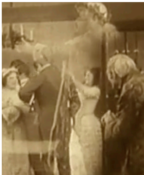
Scrooge visits Fezziwig's party in the first film adaptation of A Christmas Carol from 1910.

For some in the audience tonight, A CHRISTMAS CAROL at Alleyway Theatre has been part of your family's holiday tradition for 43 years running. But even if that is not the case, you probably know something about the story you are about to see tonight. After all, A Christmas Carol is one of the most adapted stories ever told.