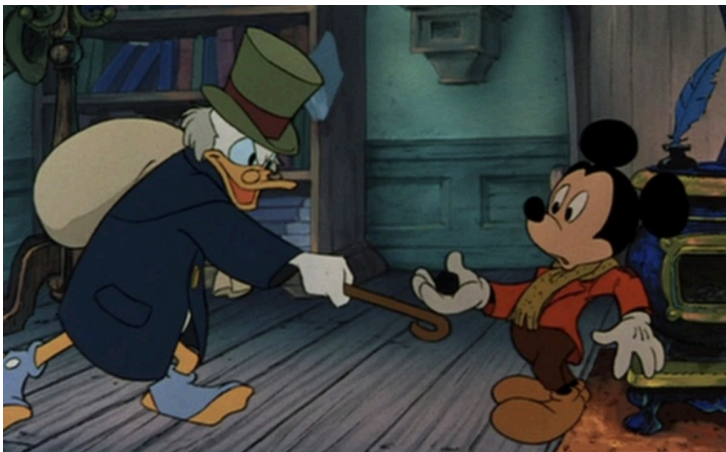
Mickey's Christmas Carol (1983) starring Scrooge McDuck as Scrooge—a role he was born to play.

For some in the audience tonight, A CHRISTMAS CAROL at Alleyway Theatre has been part of your family's holiday tradition for 43 years running. But even if that is not the case, you probably know something about the story you are about to see tonight. After all, A Christmas Carol is one of the most adapted stories ever told.