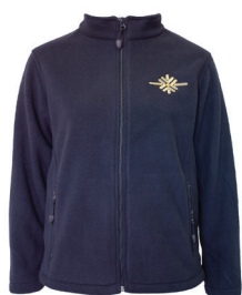
Polar Fleece Jacket