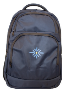
School Backpack with crest