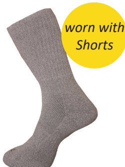
Short Walk Sock 2 pkt