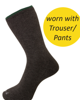
Sock Crew Grey 3pkt