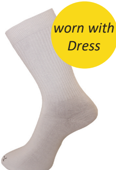
Anklet Sock 2 pkt