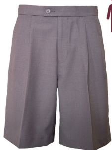
Shorts Senior Pleated