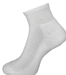
Sock Sport 2 pkt