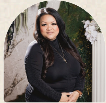
DEE SENIOR EVENT STAFF