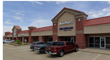
9060 HARMONY DR