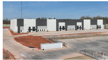
BRITTON COMMERCE CENTER