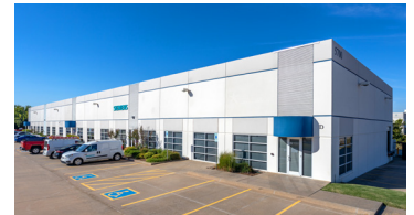
5700 SW 36TH ST