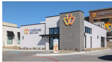
2303 N ELM PL