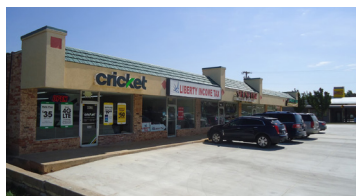
4431 NW 63RD ST