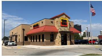
5225 N MAY AVE