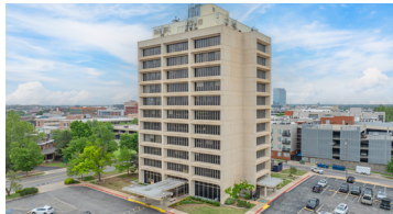
1211 N SHARTEL AVE