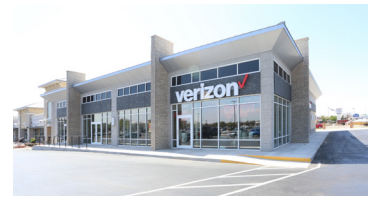
3301 S BLVD