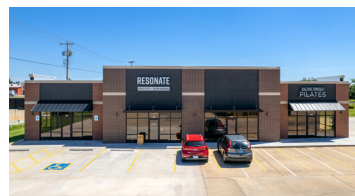
120 SE 19TH ST