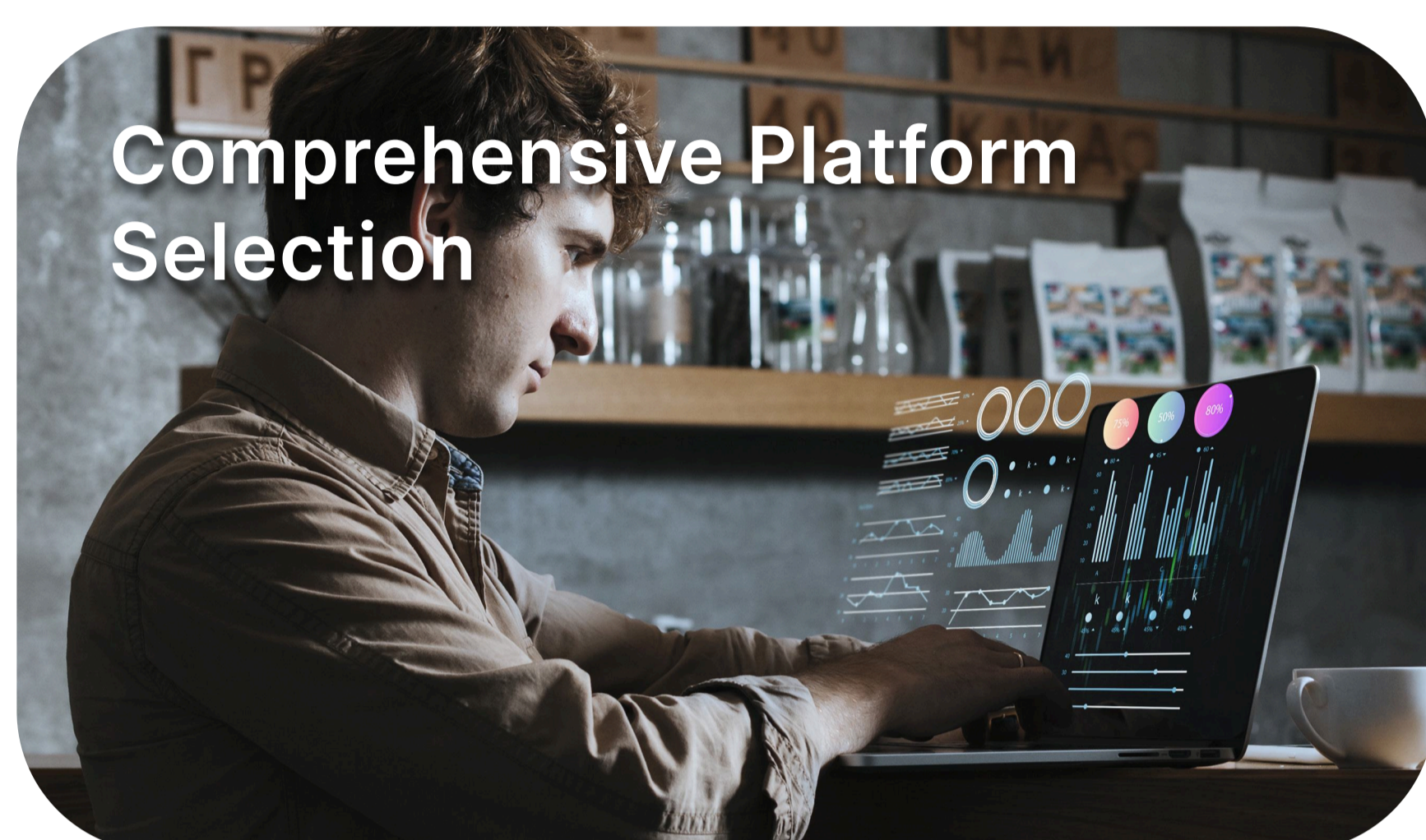
Comprehensive Platform Selection

"When selecting an AI-powered tender automation platform, choose one that supports the entire tendering process from pre-tender planning and strategy development through to producing a professionally formatted, high quality response document."