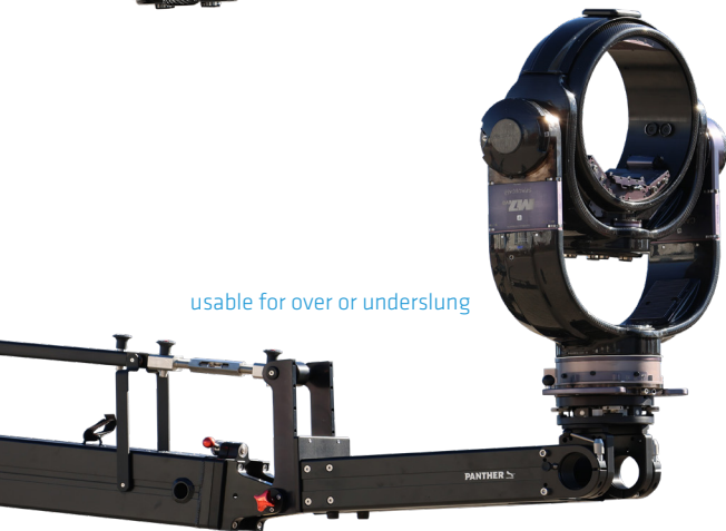
usable for over or underslung