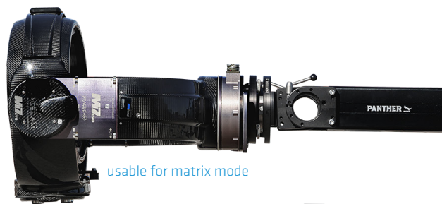
usable for matrix mode