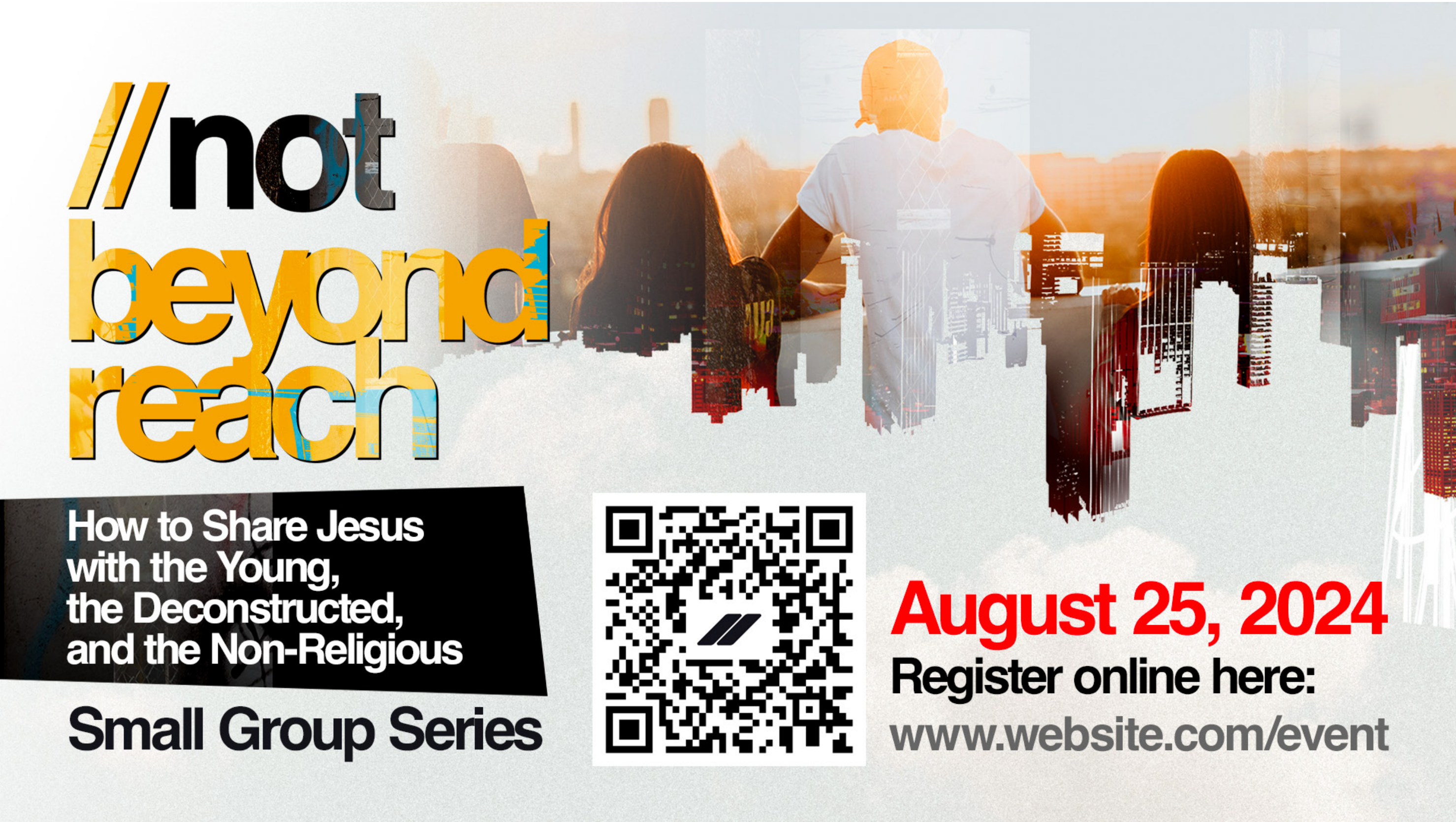
Keynote / PowerPoint Slide

You can use the editable templates below which will be provided in Figma and Photoshop formats.