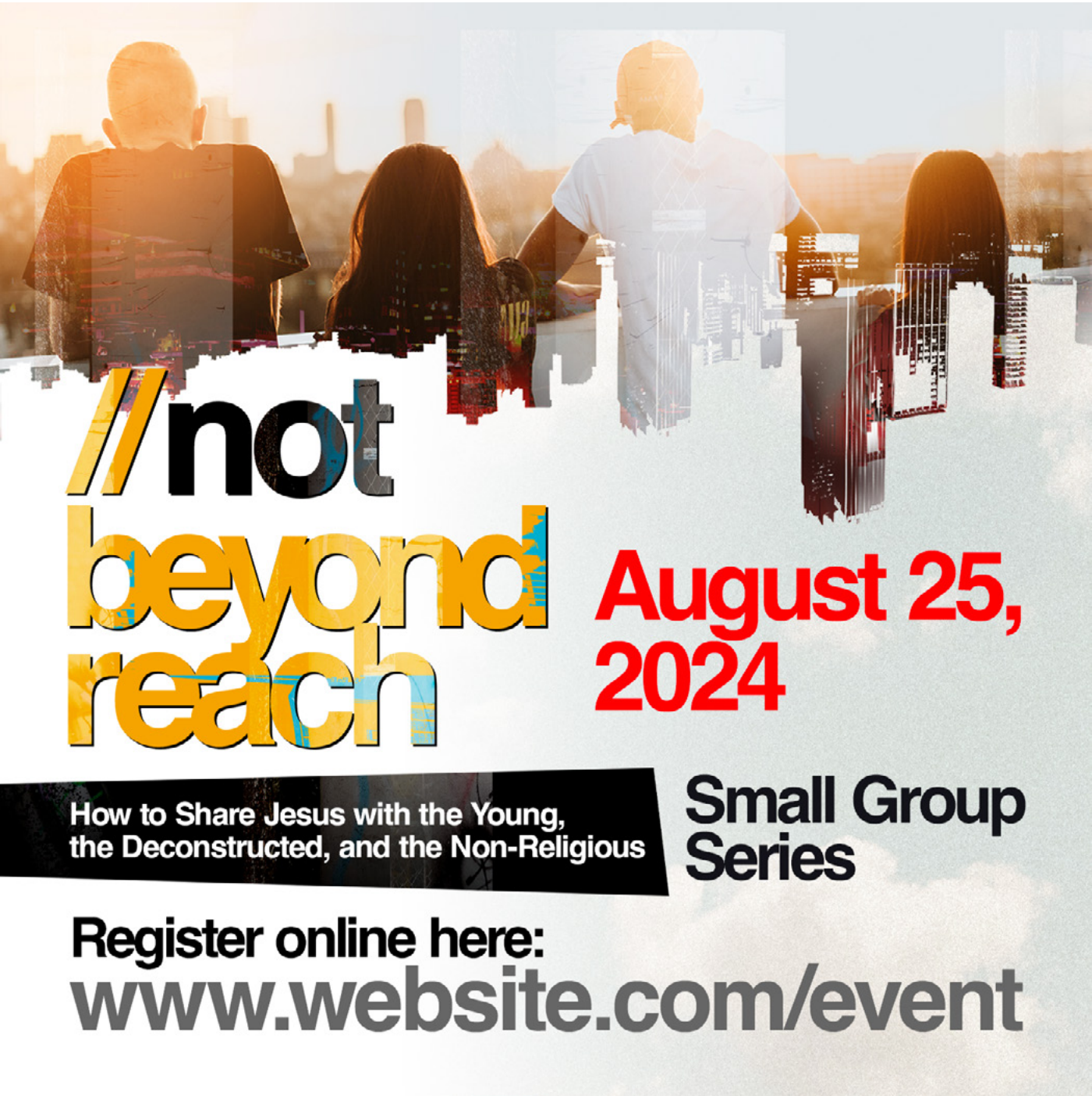
Instagram Square Post