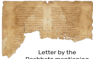
Letter by the Rashbatz mentioning Jews celebrating Shavuot.

300 Jews in the synagogue in Jerusalem on Shavuot 600 years ago, in 1440 CE!