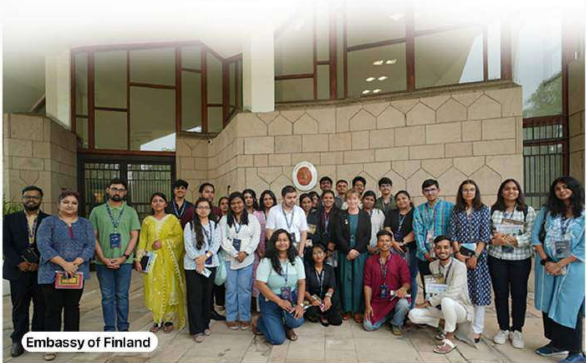
Embassy of Finland