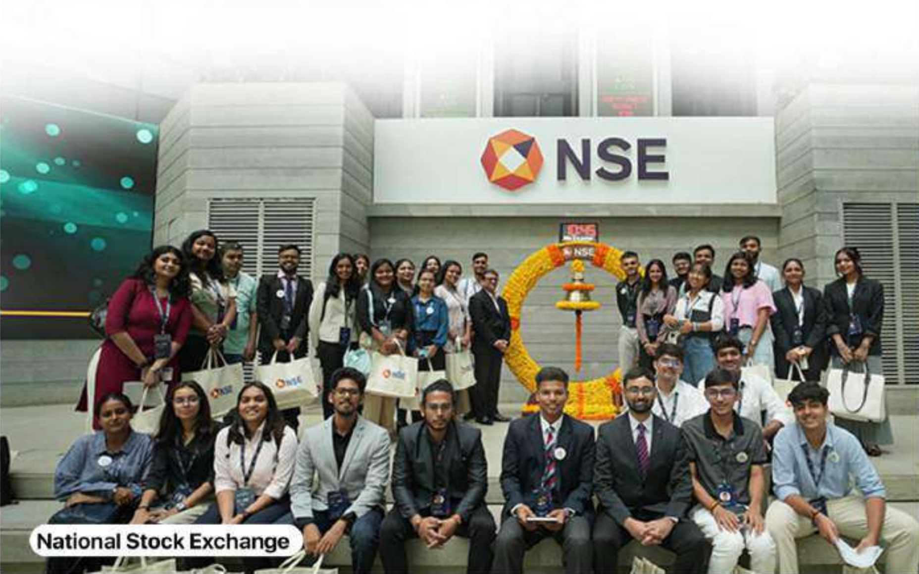
National Stock Exchange