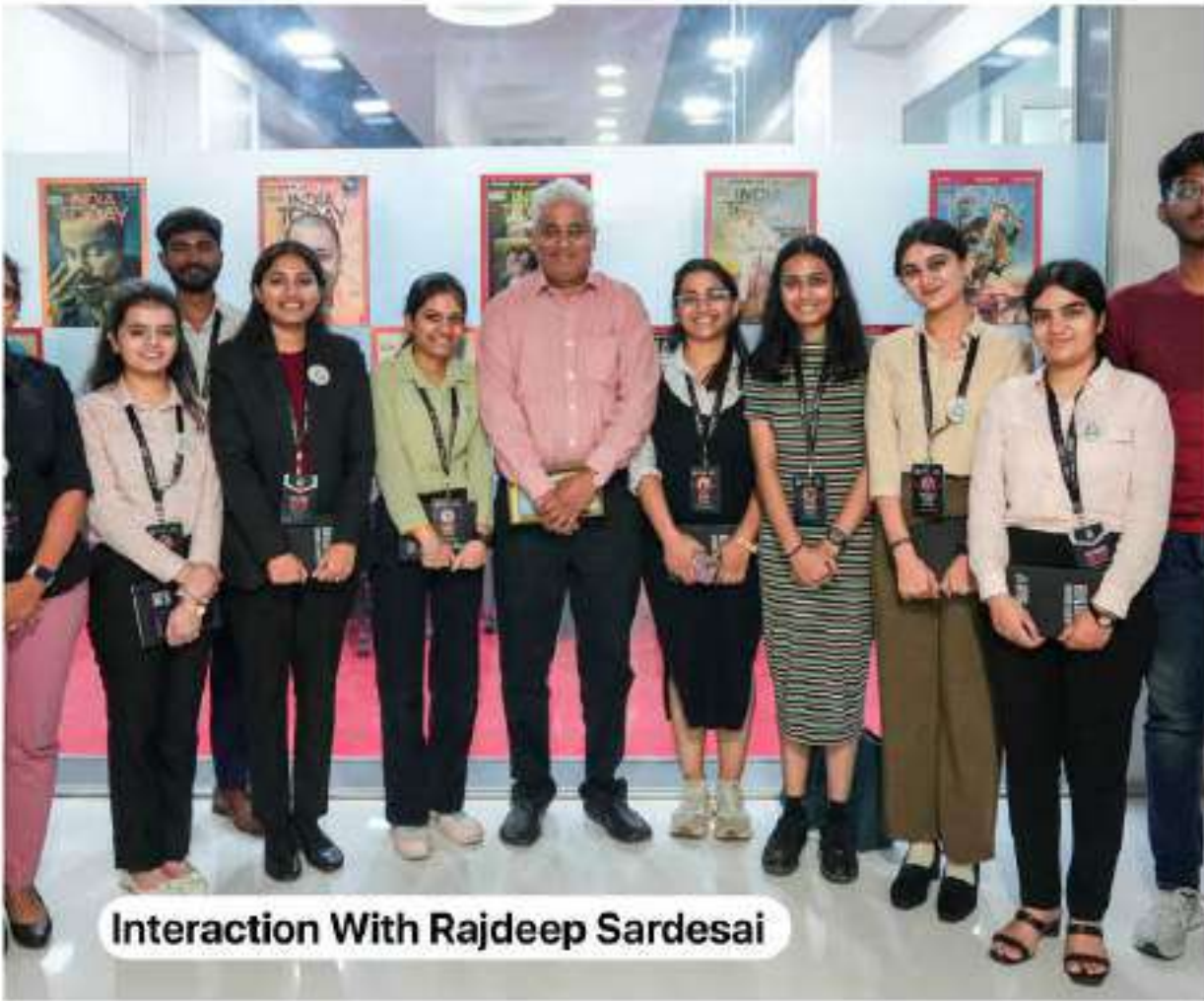
Interaction With Rajdeep Sardesai