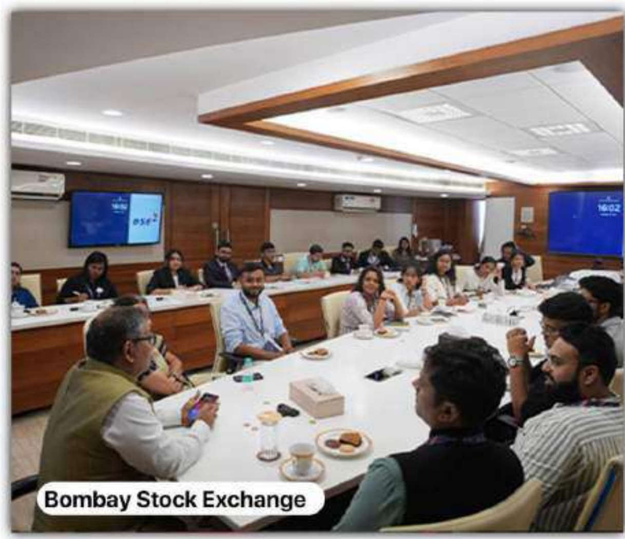
Bombay Stock Exchange