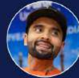
JACKKY BHAGNANI Indian Actor And Film Producer