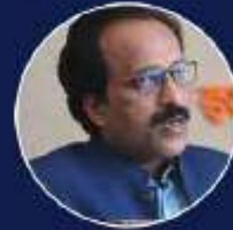
S. SOMANATH Chairman of ISRO