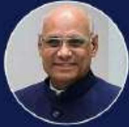
RAMESH BAIS Former Governor of Maharashtra