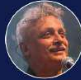
PIYUSH MISHRA Indian Actor And Singer