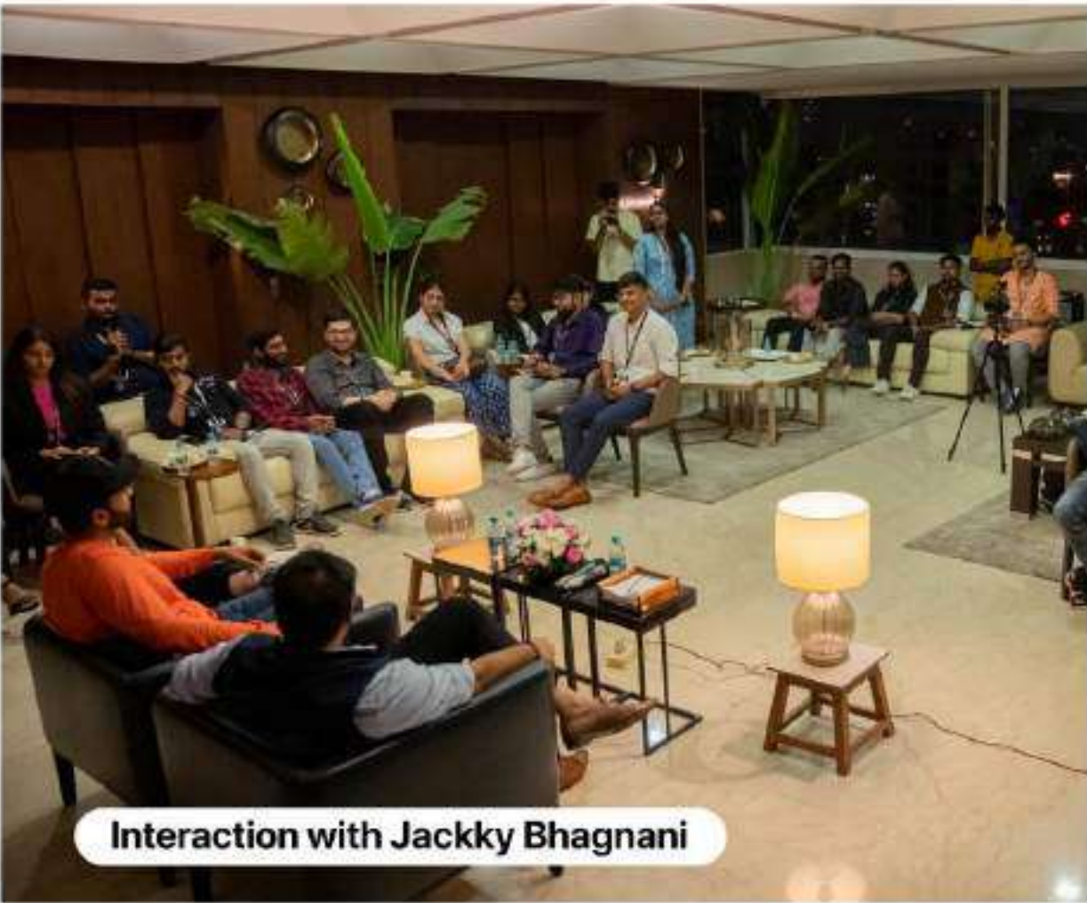
Interaction with Jackky Bhagnani