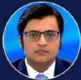
ARNAB GOSWAMI Editor-in-chief of Republic TV