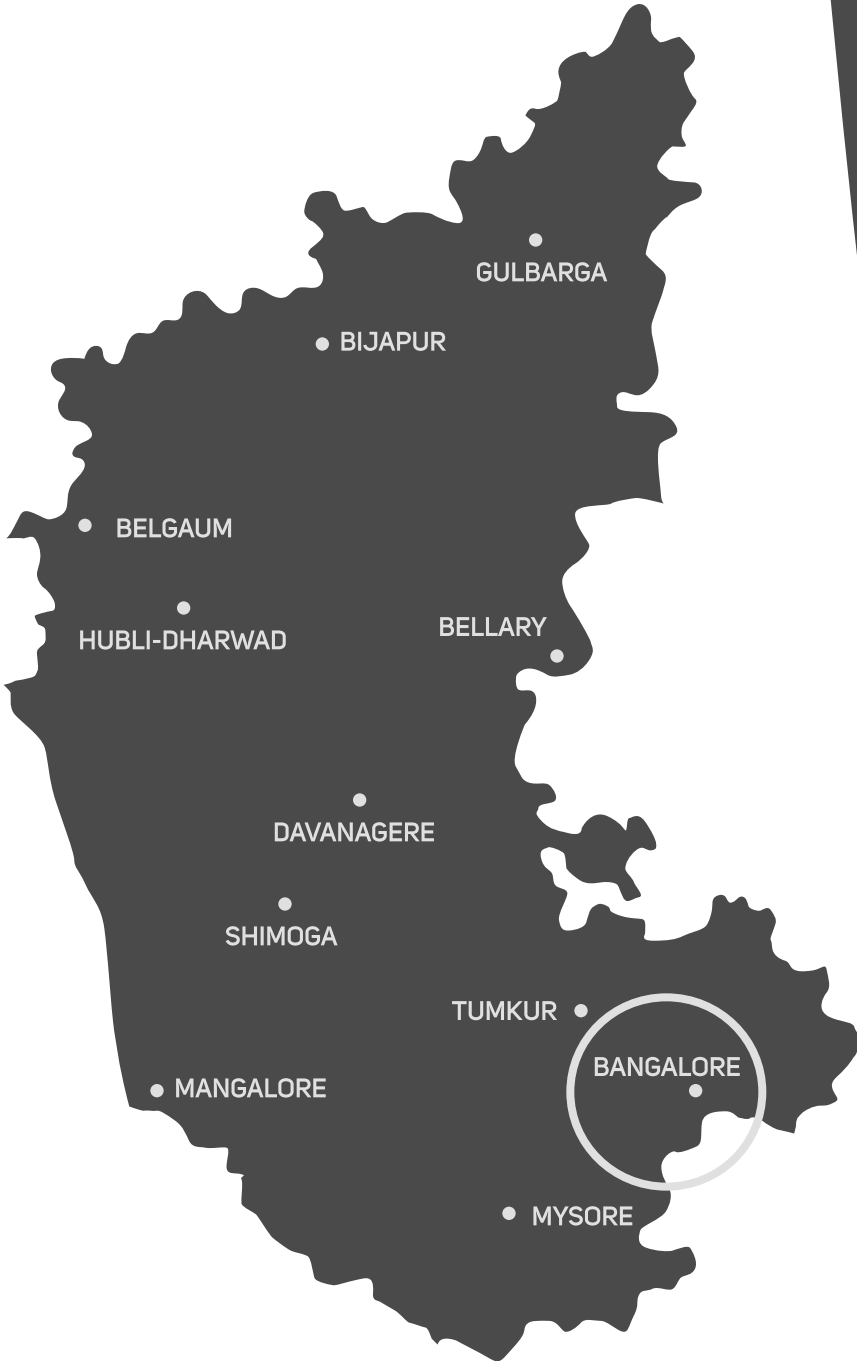
MAP OF KARNATAKA