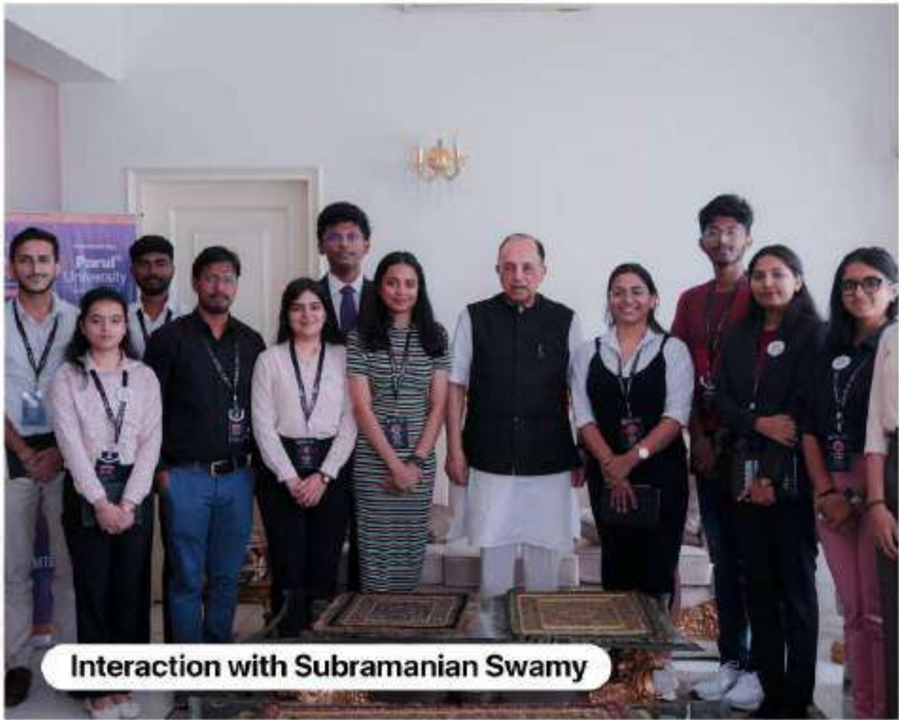
Interaction with Subramanian Swamy