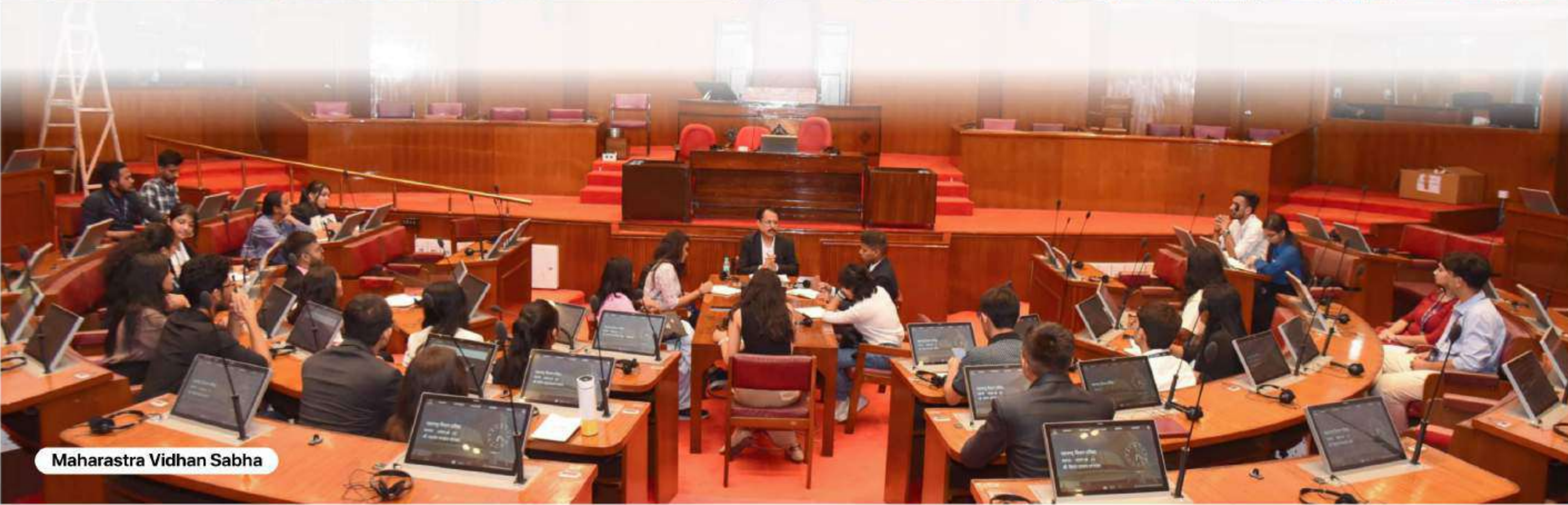
Maharashtra Vidhan Sabha