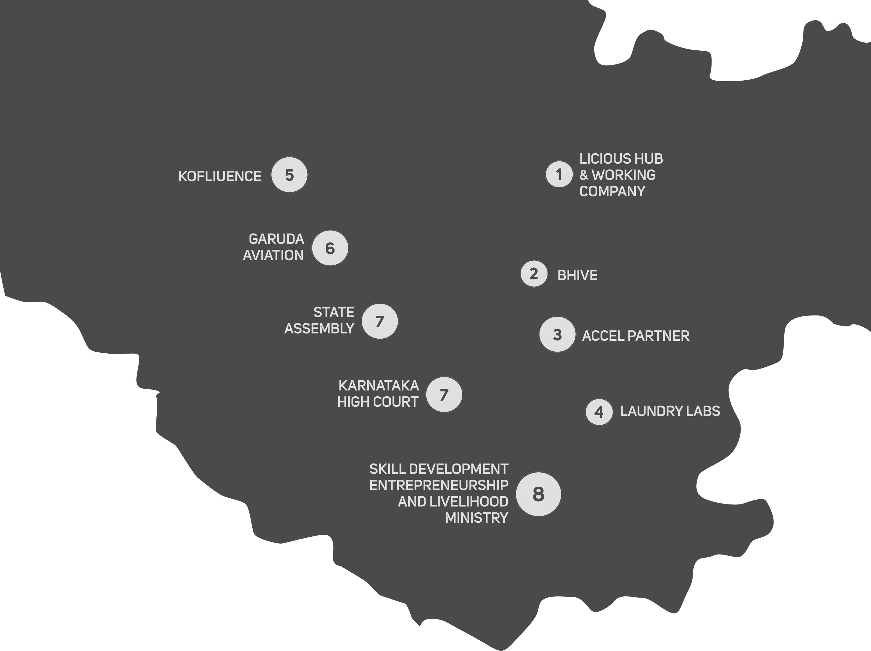
ZOOMED IN VERSION