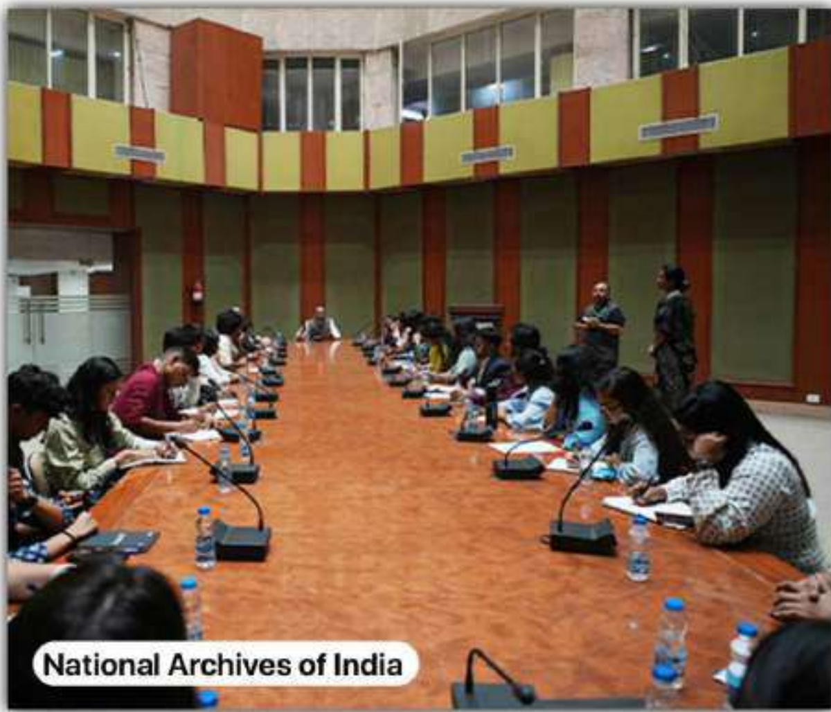
National Archives of India