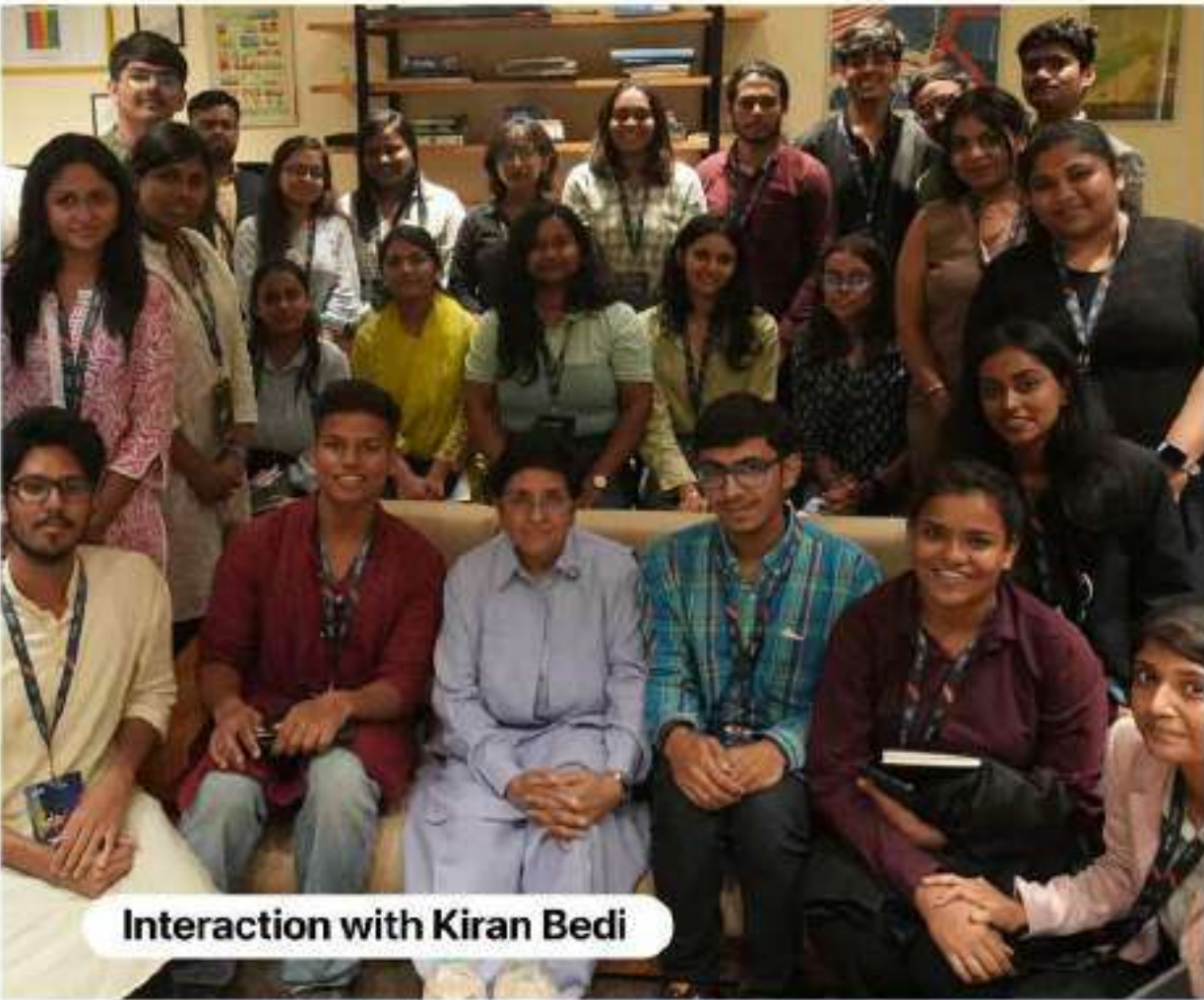
Interaction with Kiran Bedi