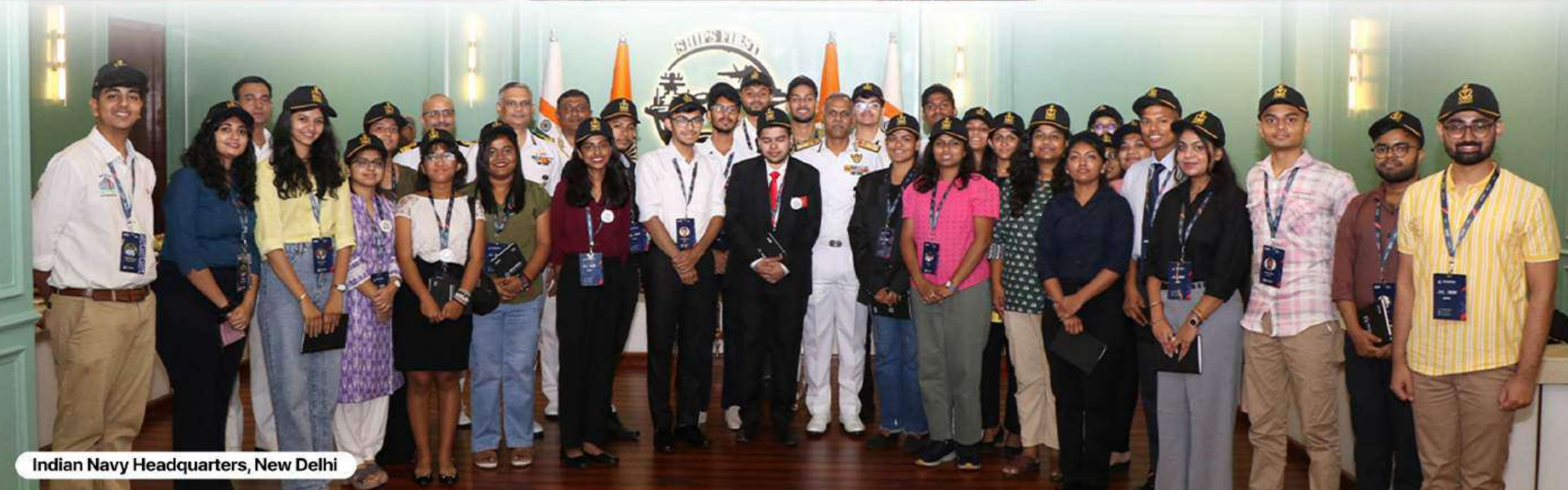
Indian Navy Headquarters, New Delhi