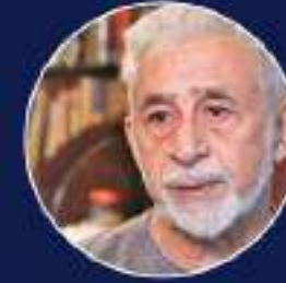
NASEERUDDIN SHAH Indian Actor