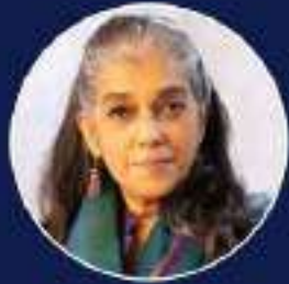
RATNA PATHAK SHAH Indian Actress