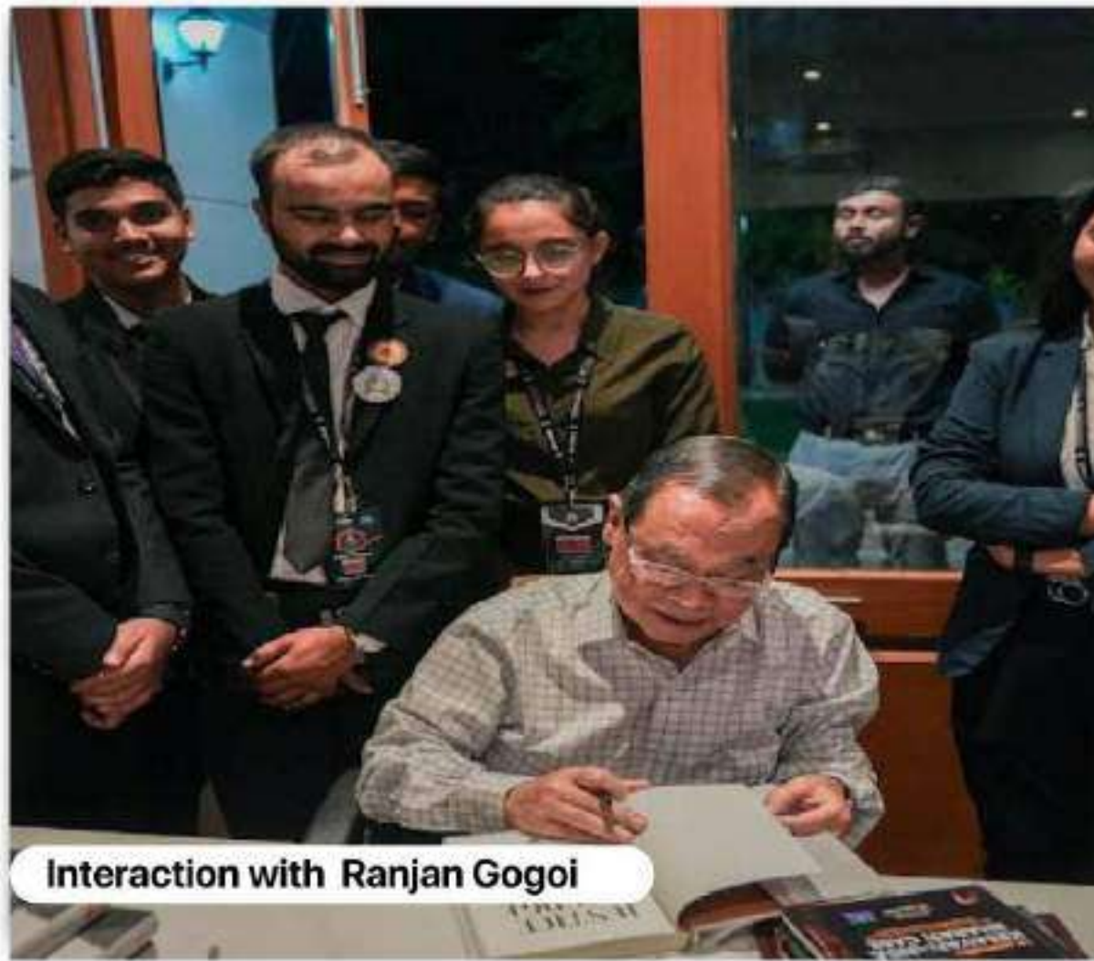
Interaction with Ranjan Gogoi