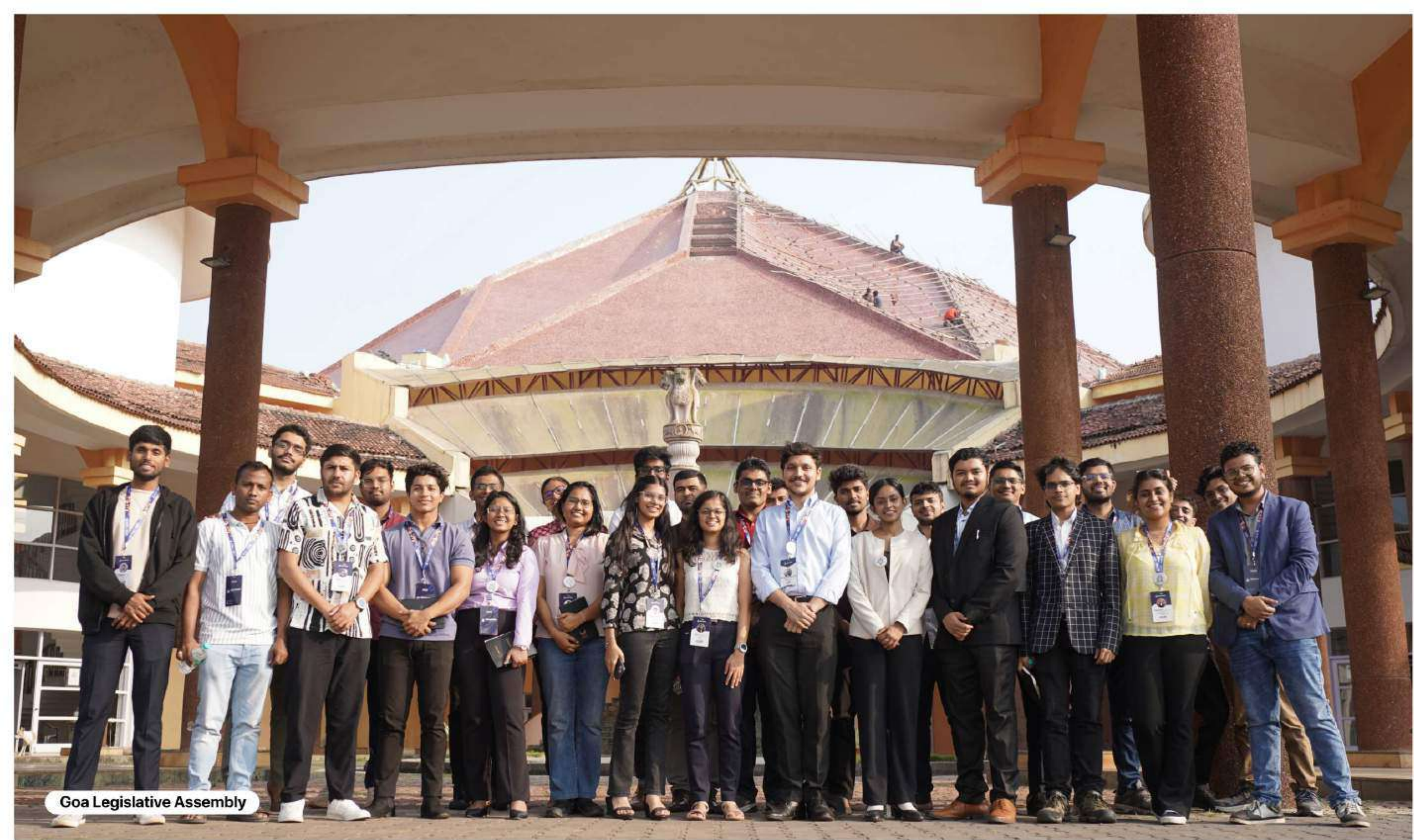
Goa Legislative Assembly