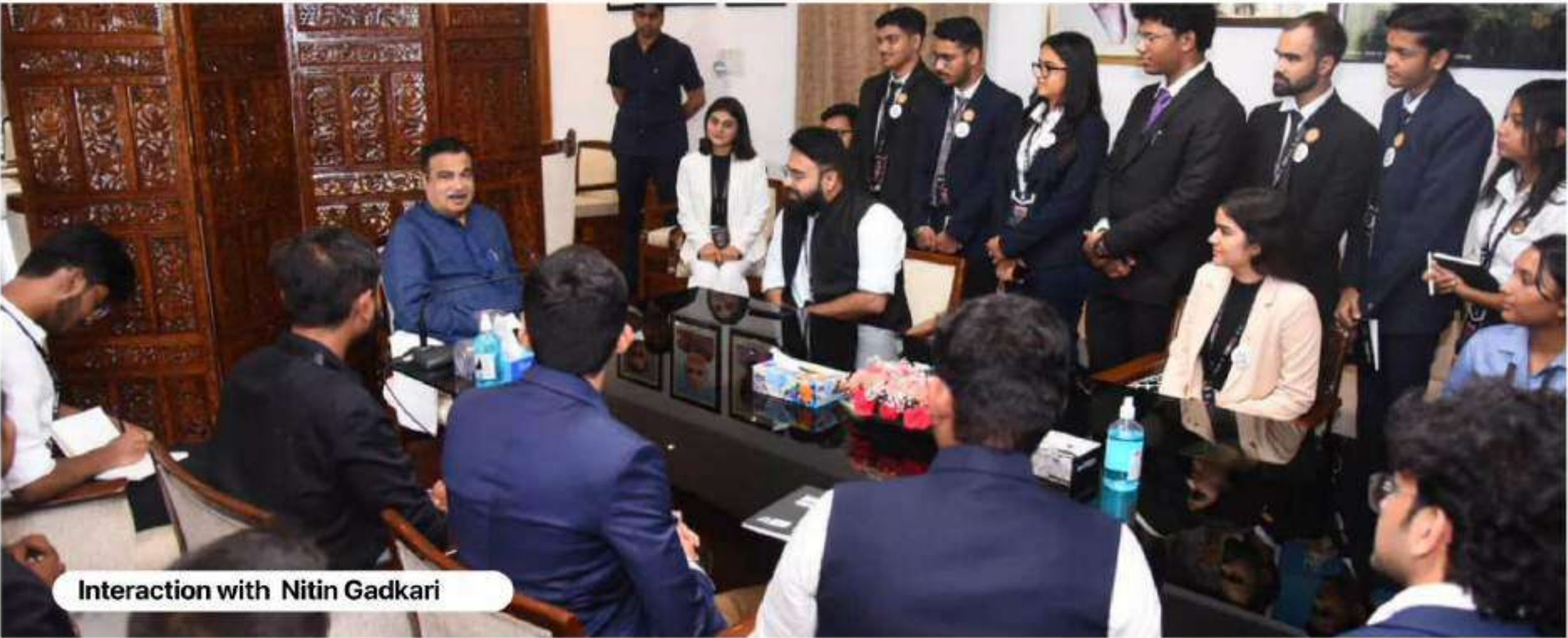
Interaction with Nitin Gadkari