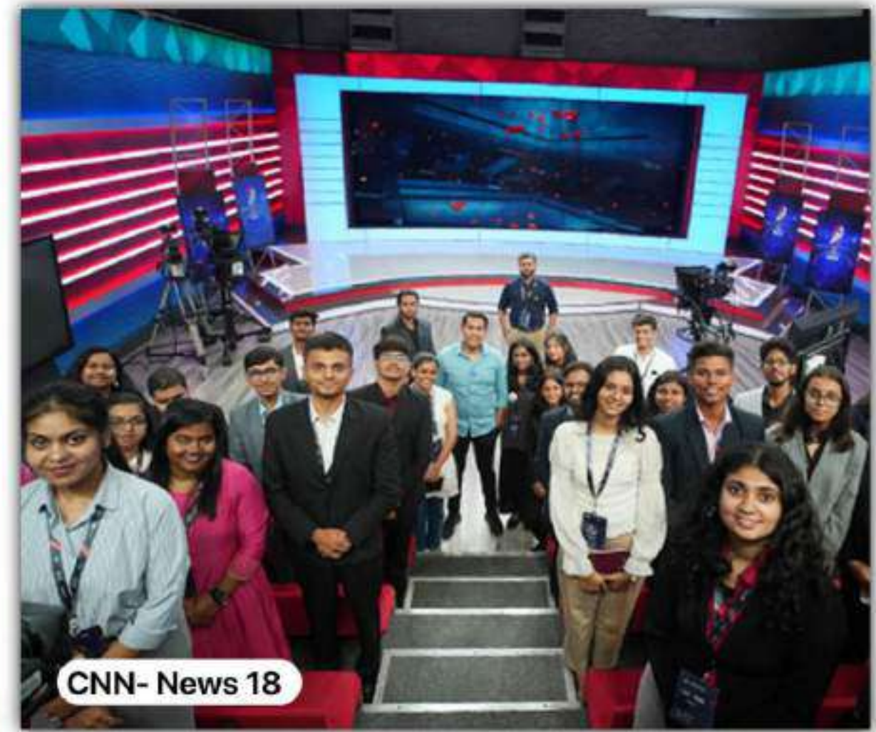
CNN- News 18