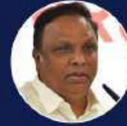
ADV. ASHISH SHELAR

Whole Time Member, SEBI & Former Managing Director, SBI Bank & CEO, SBI Mutual Funds