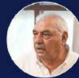
BHUPINDER HOODA Former Chief Minister of Haryana