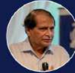
SHRI SURESH PRABHU