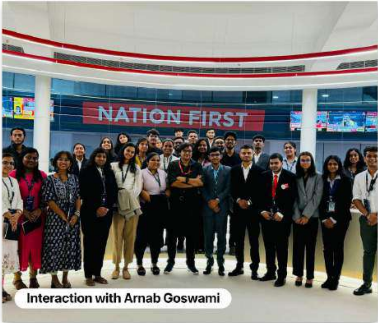
Interaction with Arnab Goswami