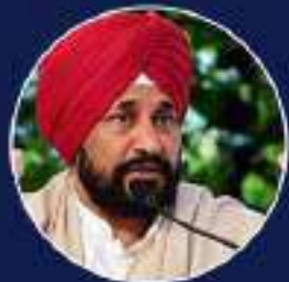
CHARANJIT SINGH CHANNI