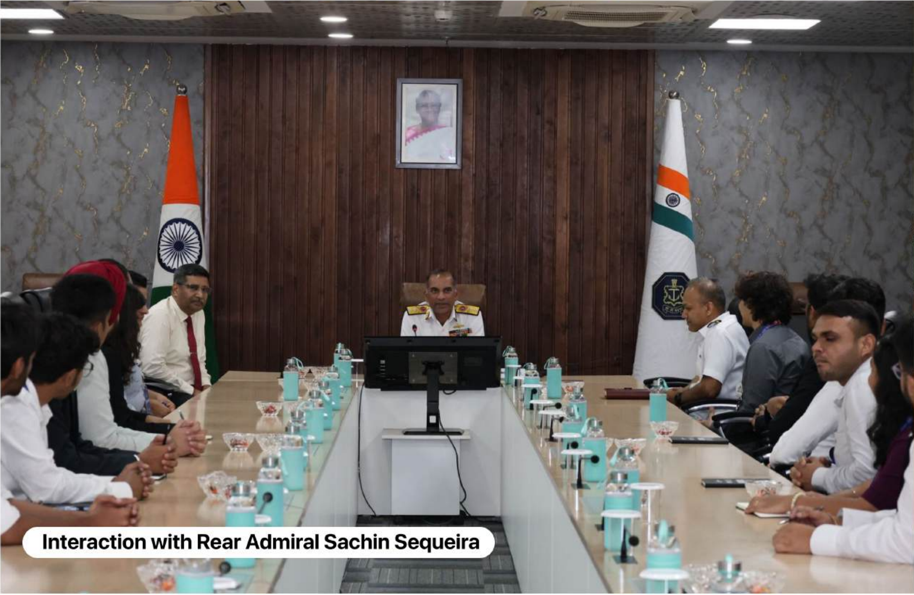
Interaction with Rear Admiral Sachin Sequeira