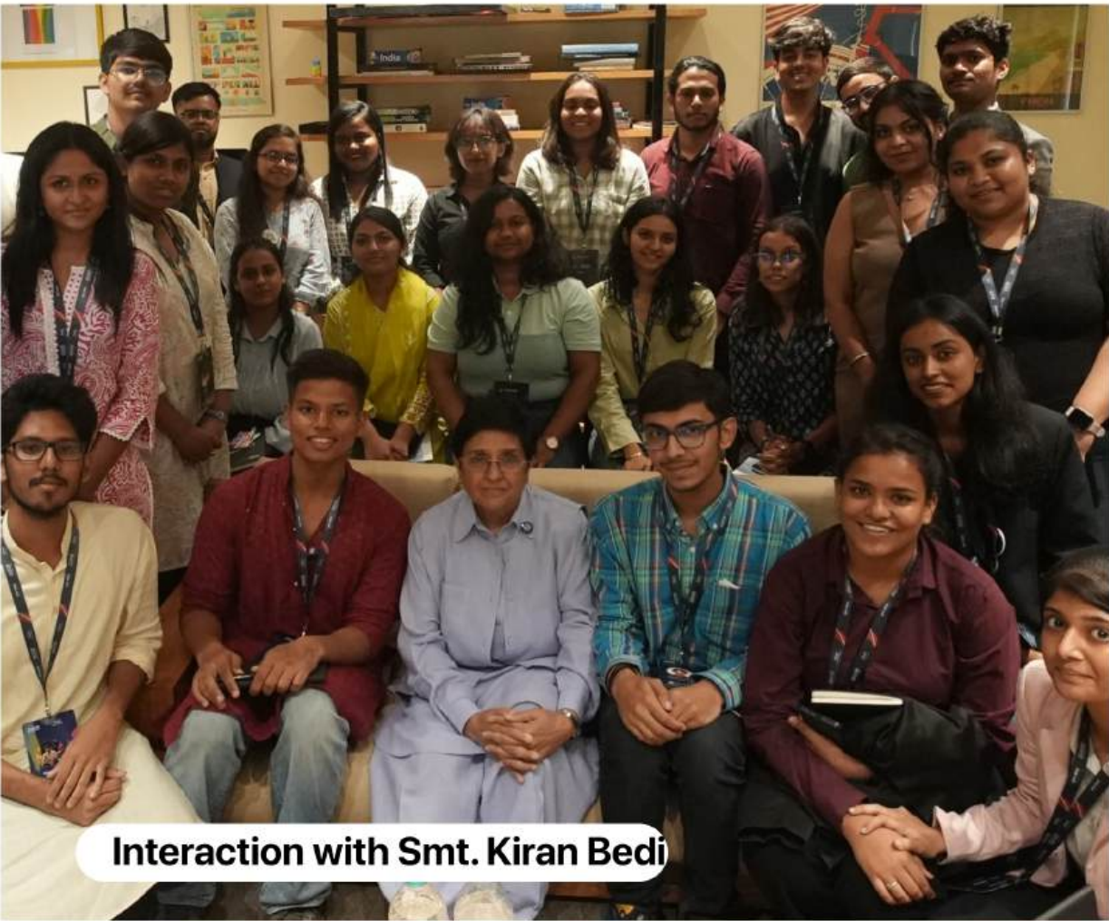
Interaction with Smt. Kiran Bedi