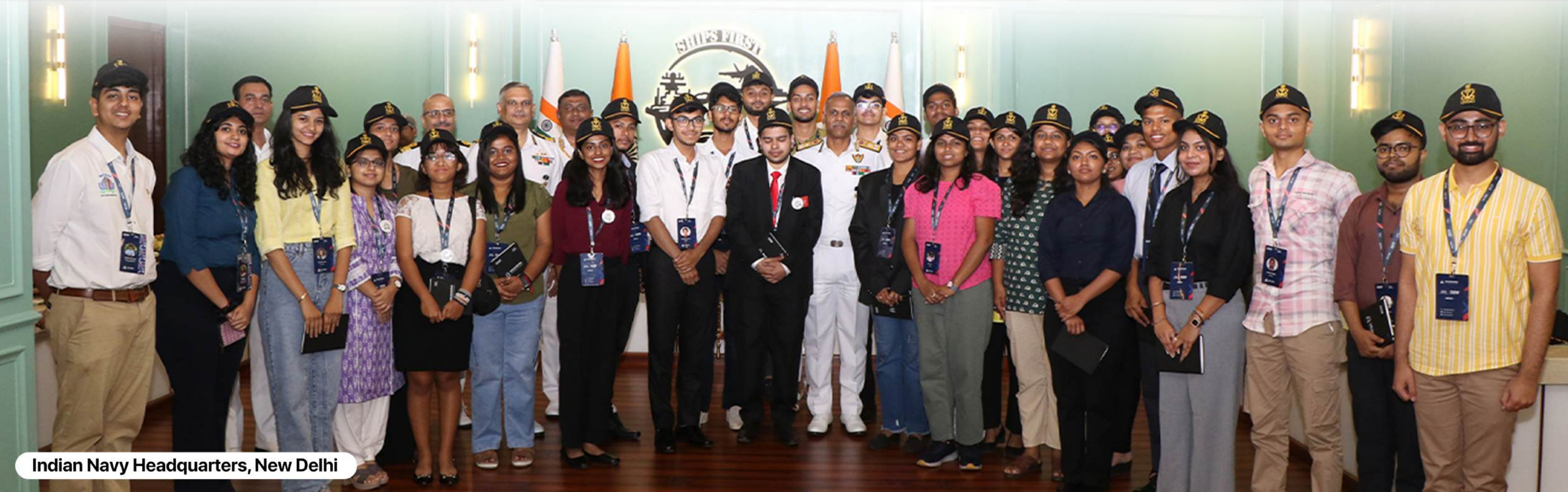
Indian Navy Headquarters, New Delhi