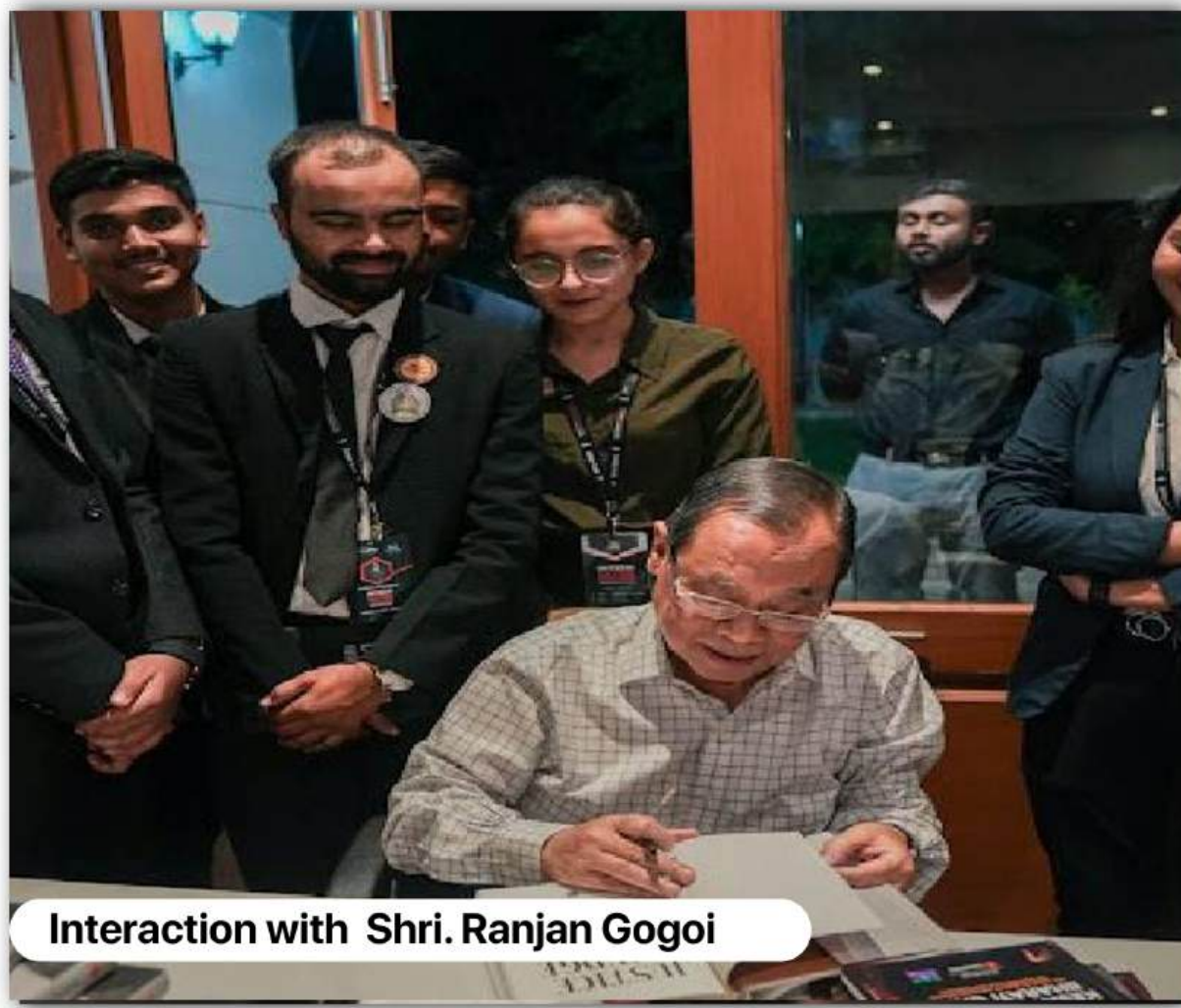
Interaction with Shri. Ranjan Gogoi