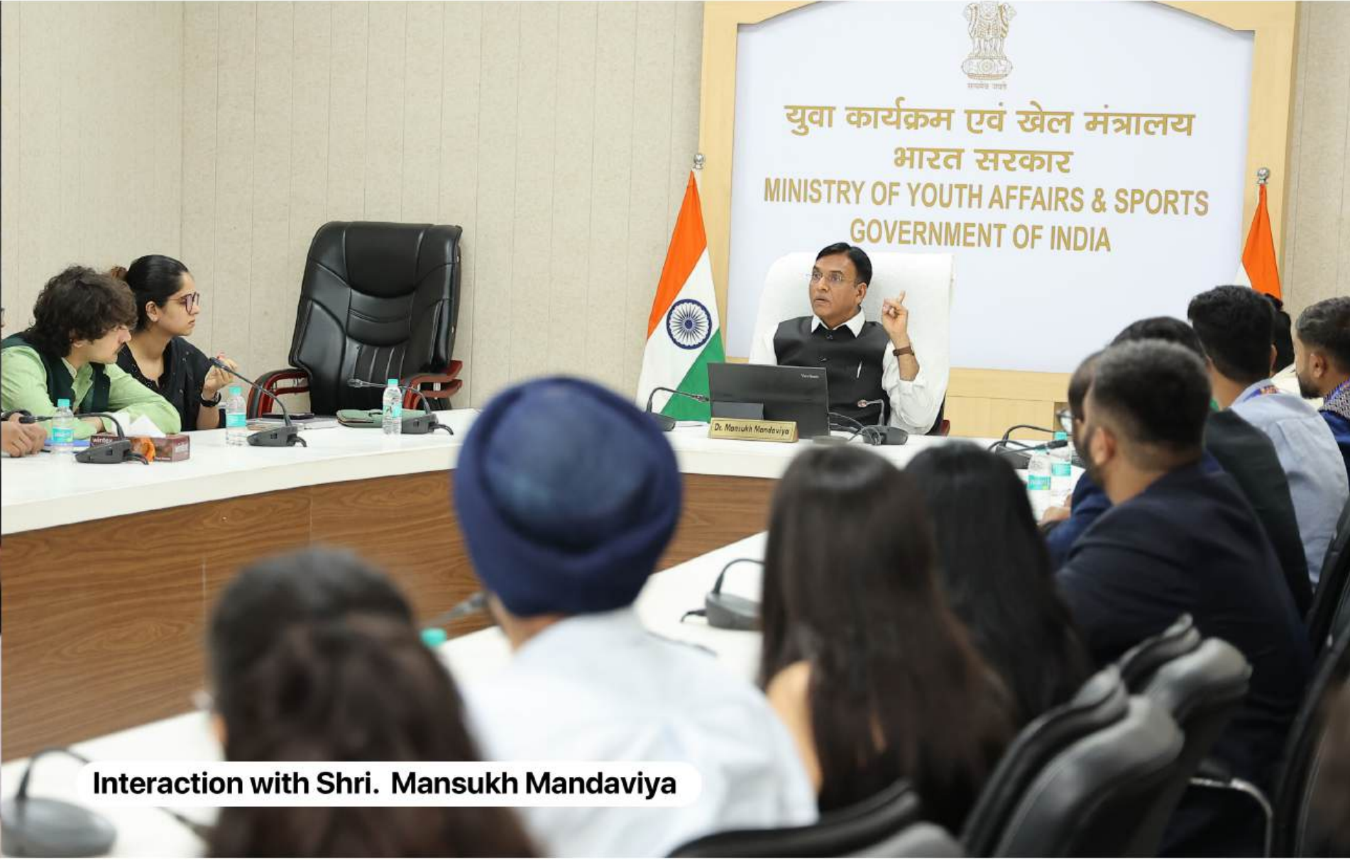
Interaction with Shri. Mansukh Mandaviya