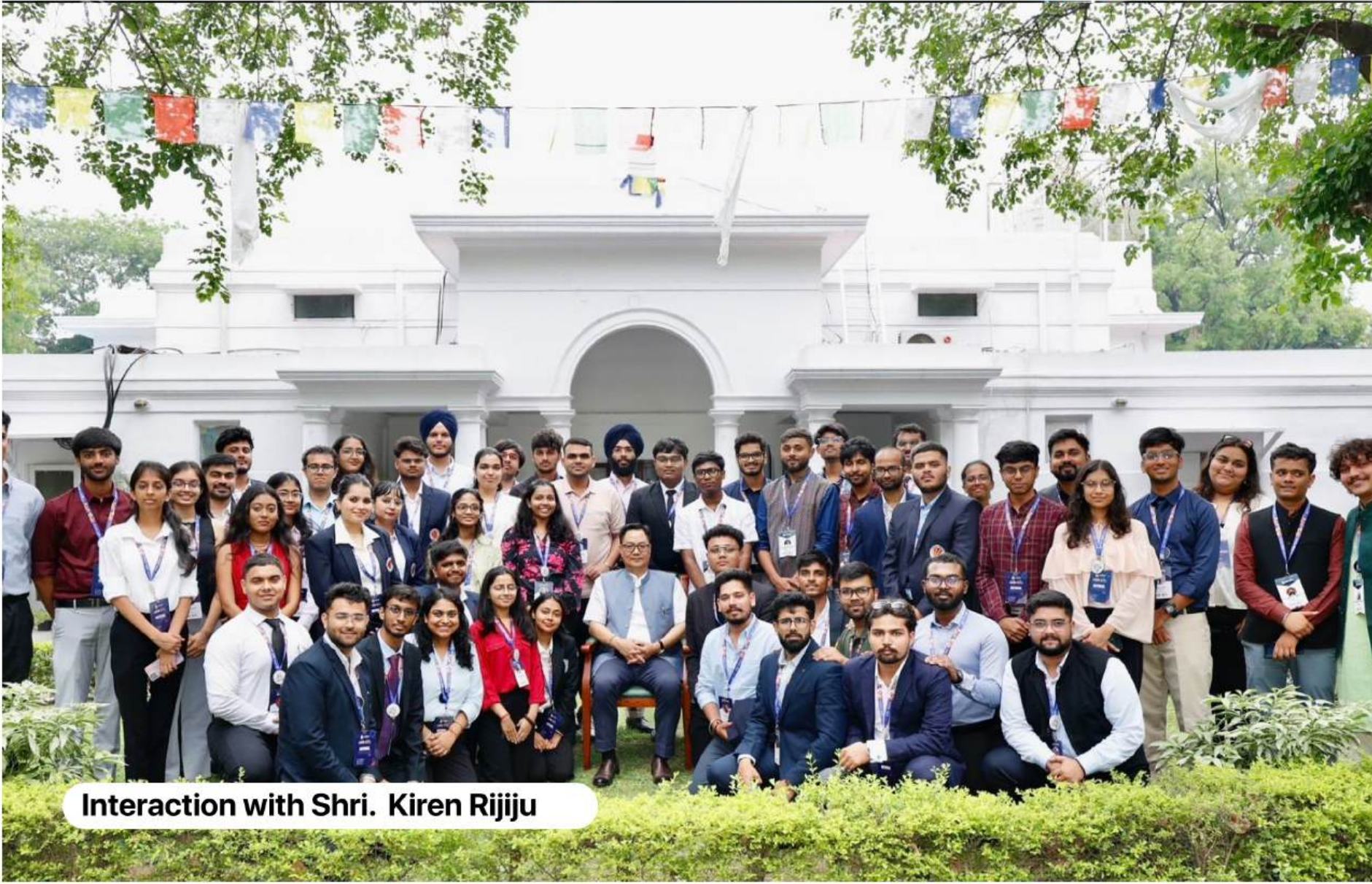
Interaction with Shri. Kiren Rijju