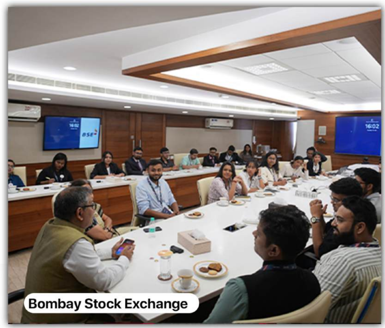
Bombay Stock Exchange