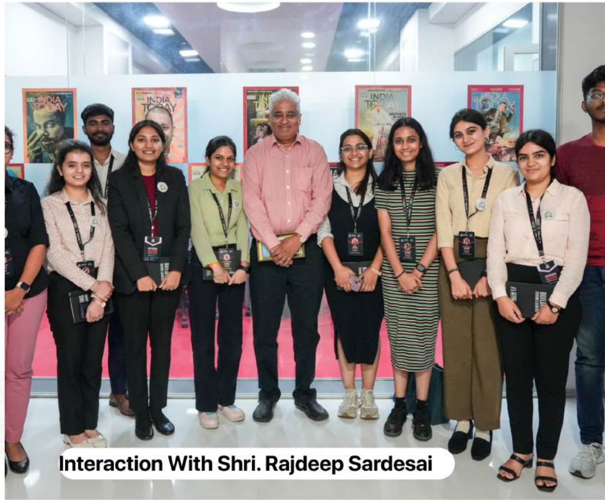
Interaction With Shri. Rajdeep Sardesai