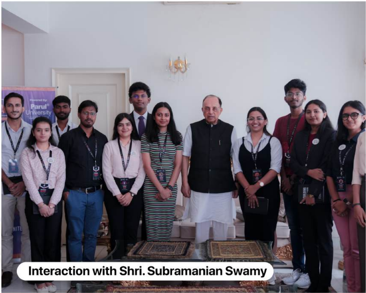
Interaction with Shri. Subramanian Swamy