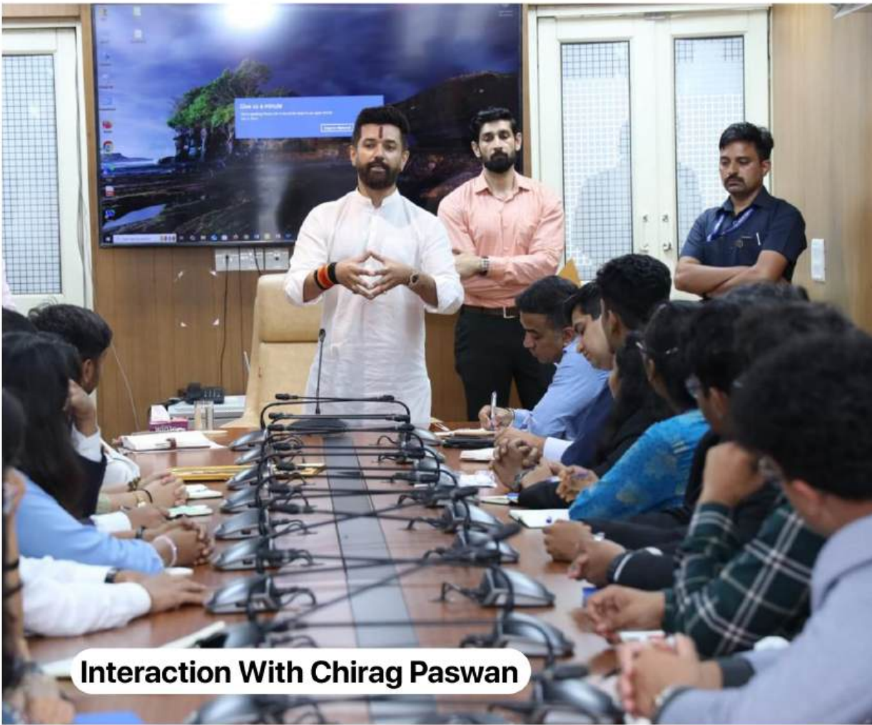
Interaction With Chirag Paswan