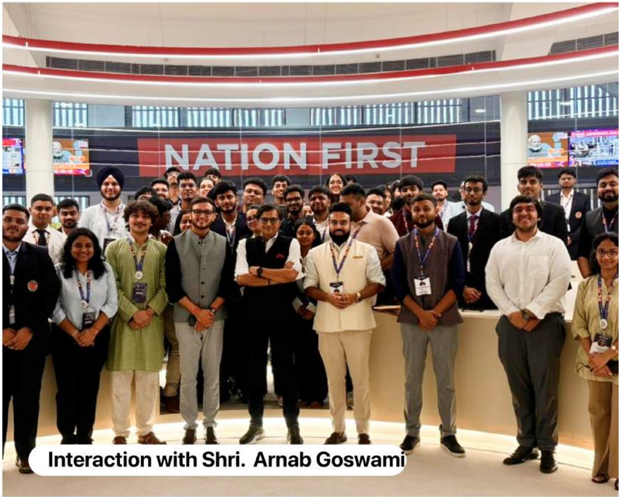
Interaction with Shri. Arnab Goswami