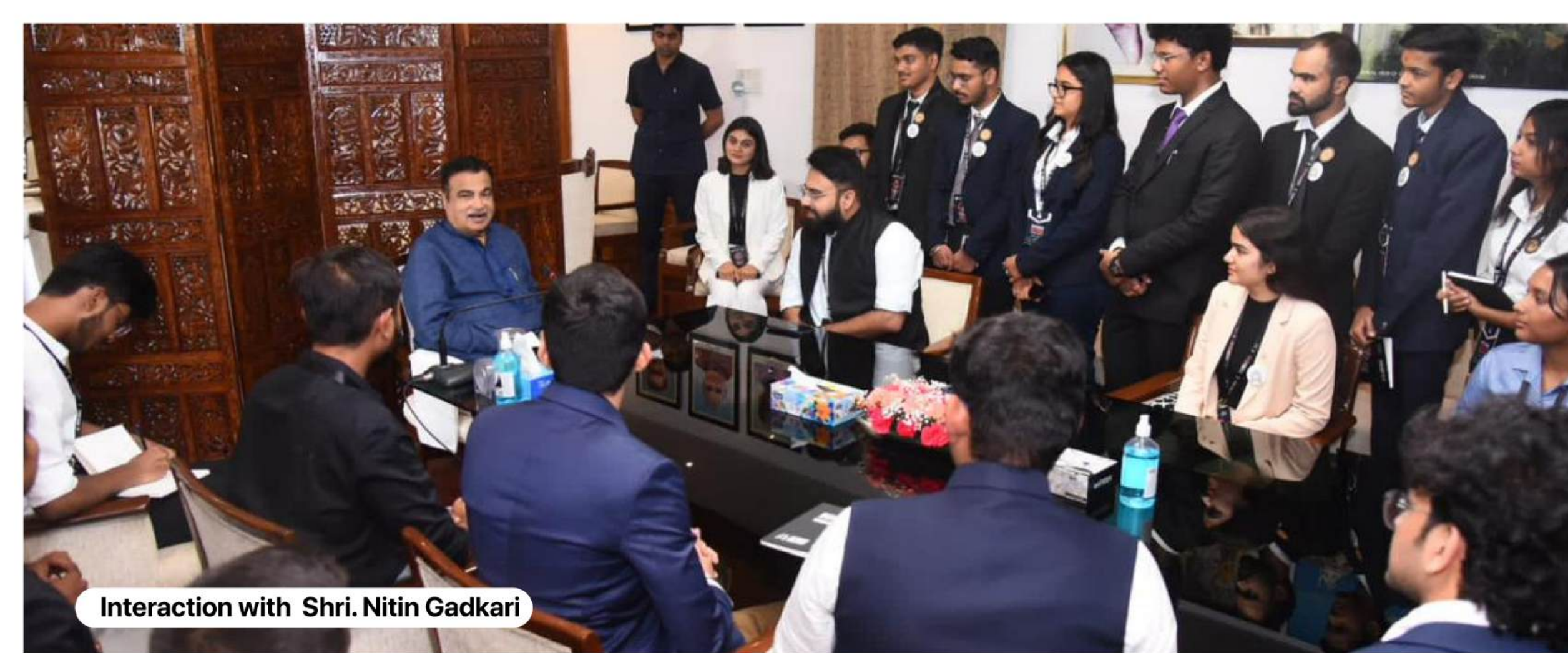
Interaction with Shri. Nitin Gadkari