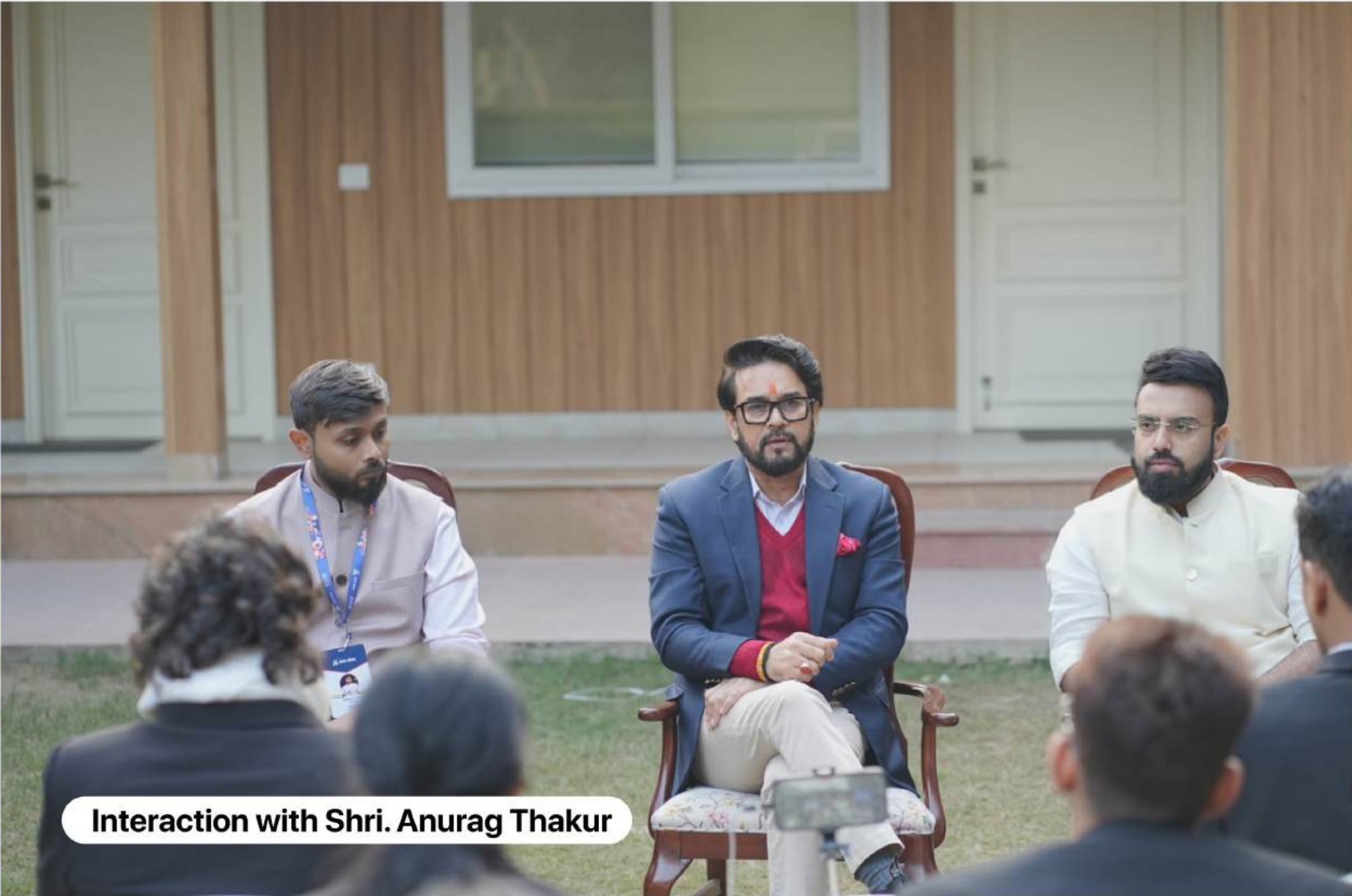
Interaction with Shri. Anurag Thakur