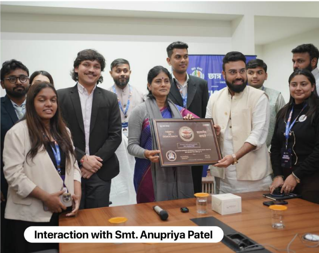
Interaction with Smt. Anupriya Patel