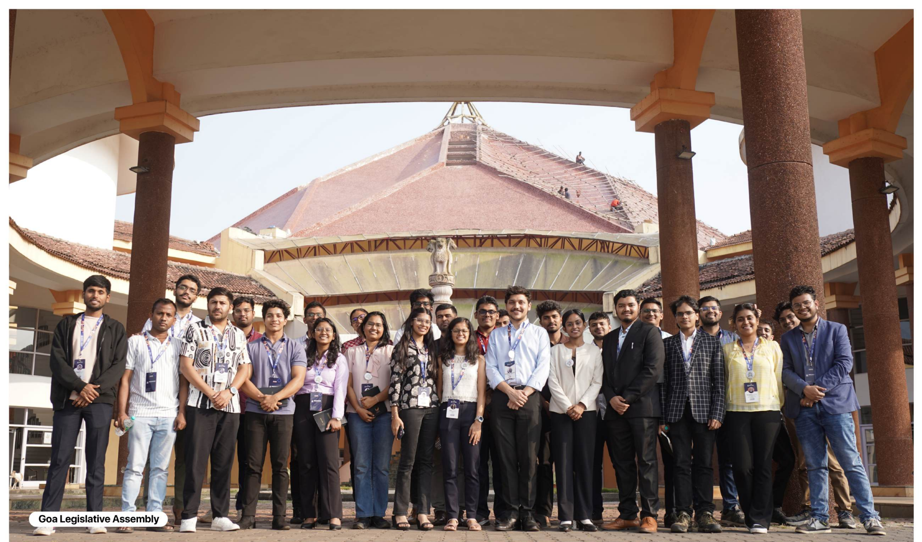
Goa Legislative Assembly