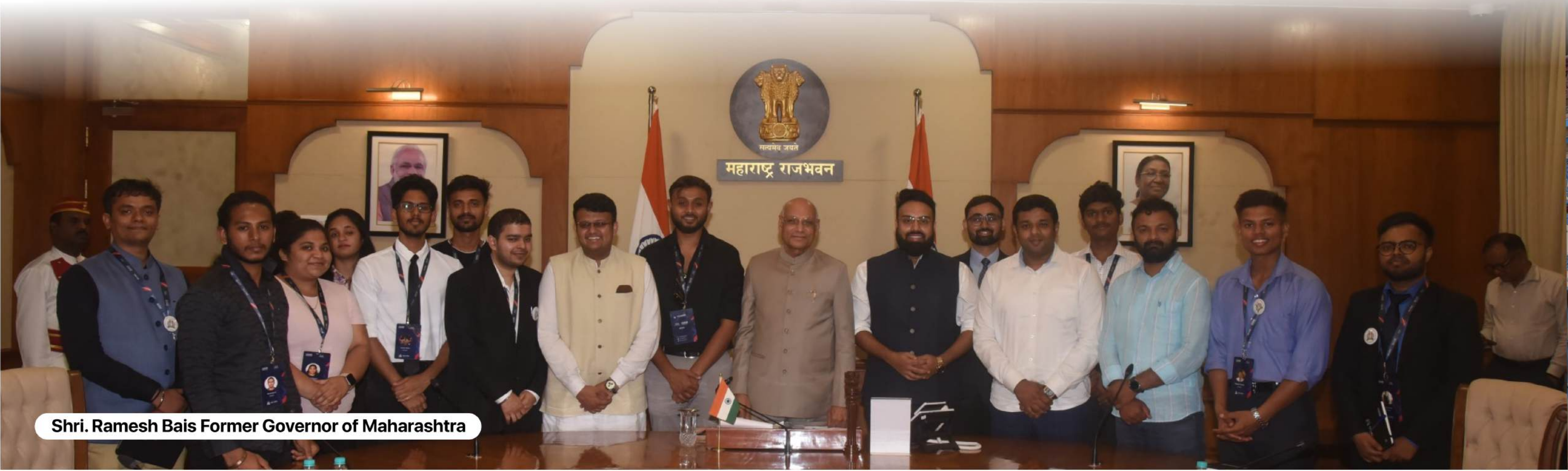
Shri. Ramesh Bais Former Governor of Maharashtra