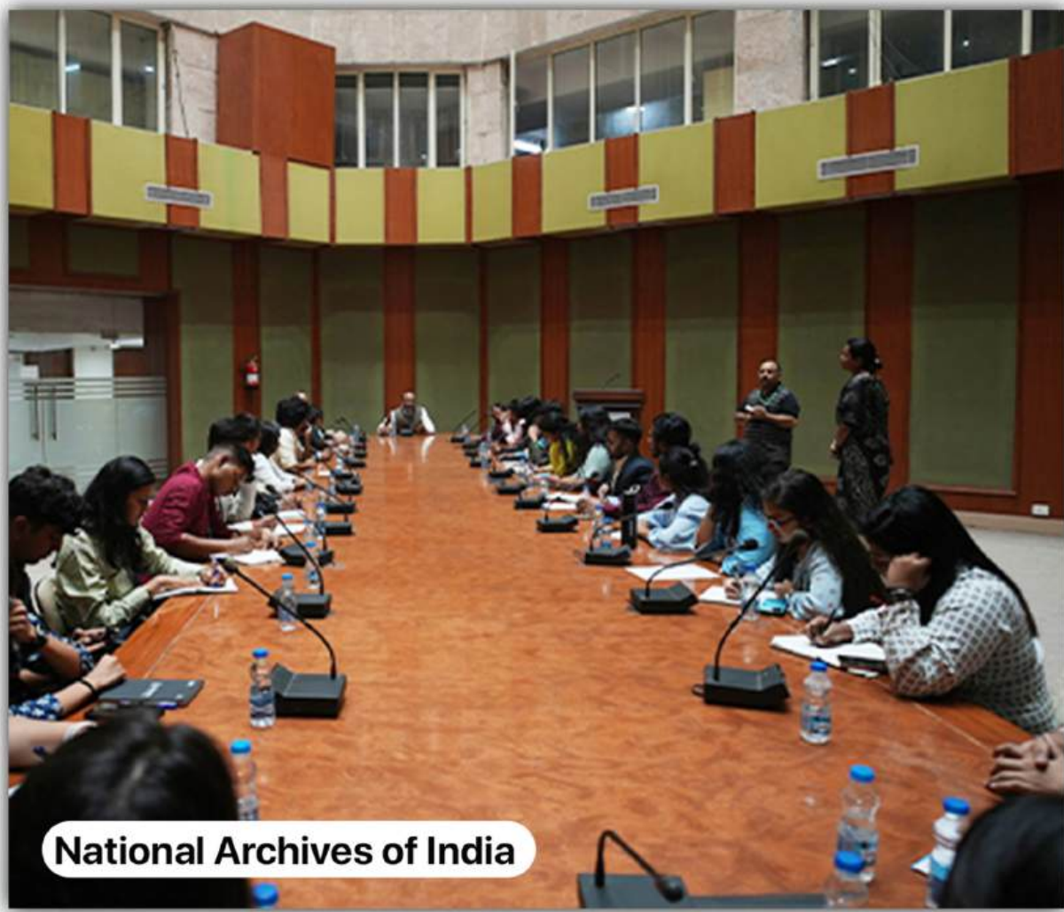
National Archives of India