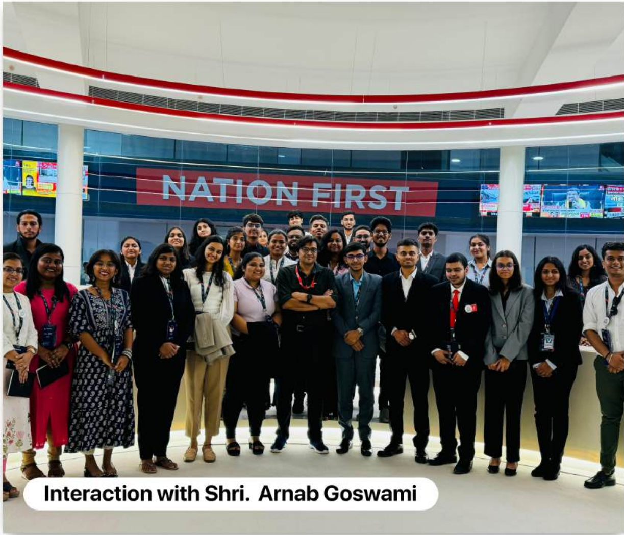
Interaction with Shri. Arnab Goswami