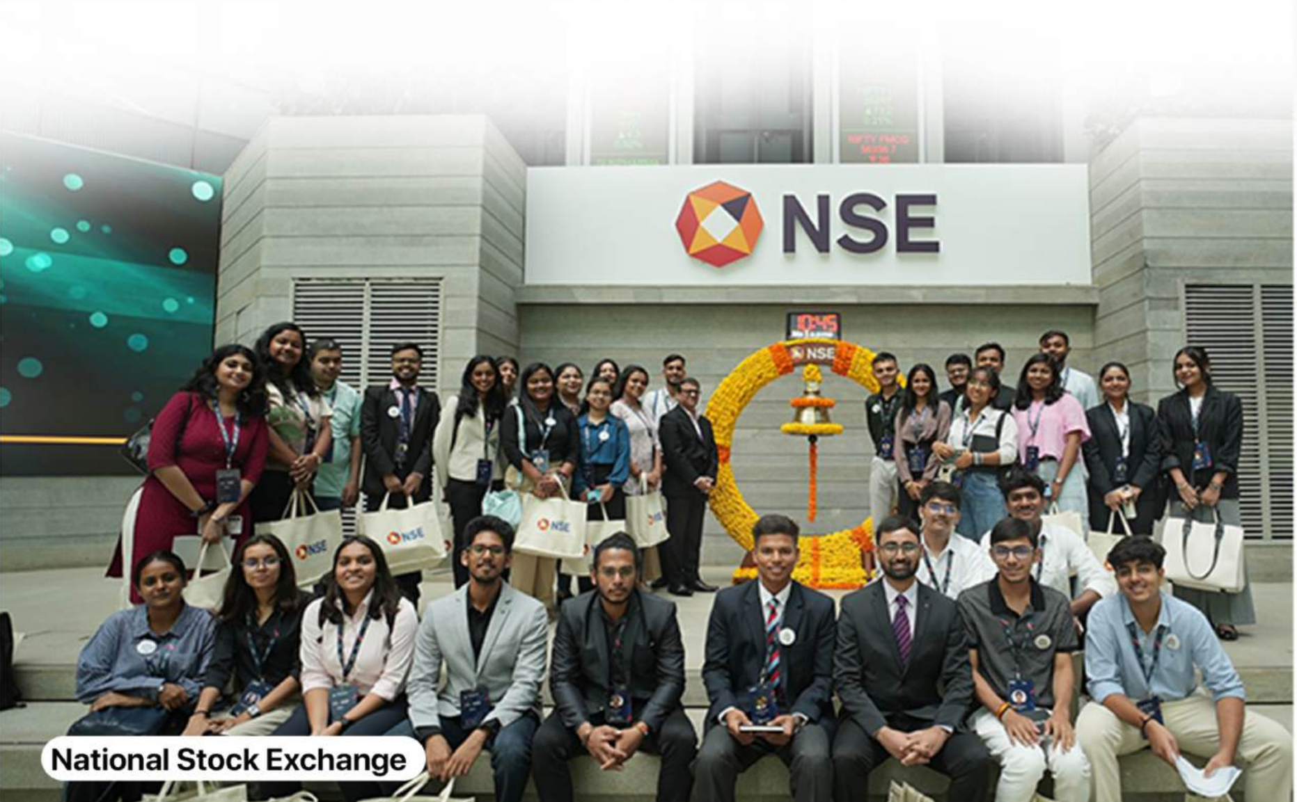
National Stock Exchange