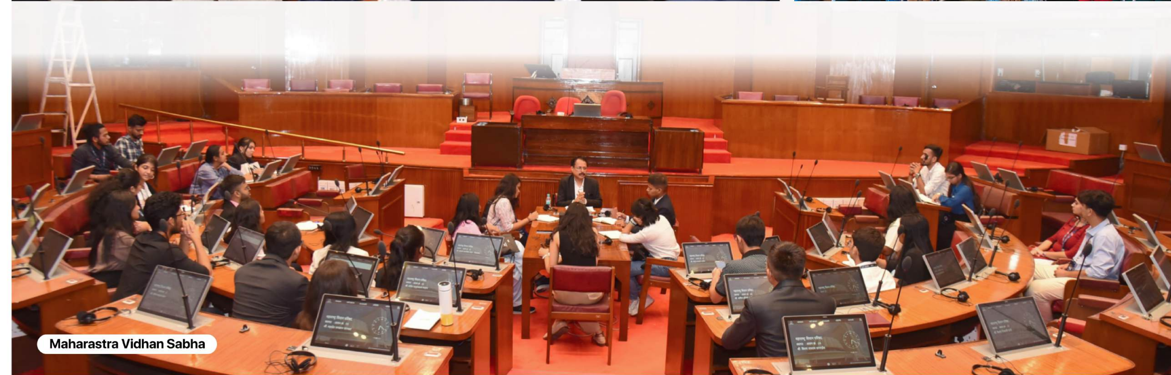
Maharashtra Vidhan Sabha