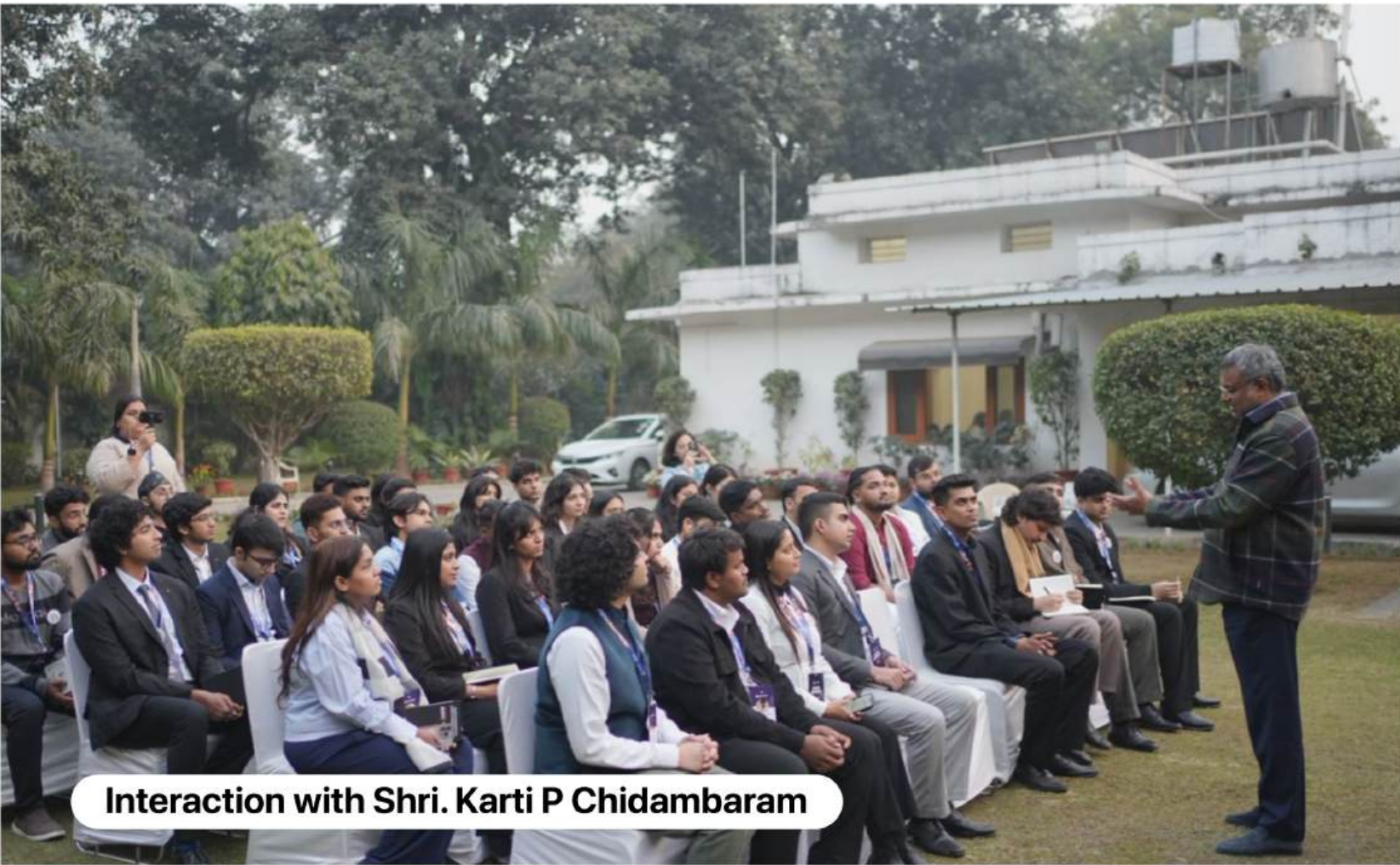
Interaction with Shri. Karti P Chidambaram