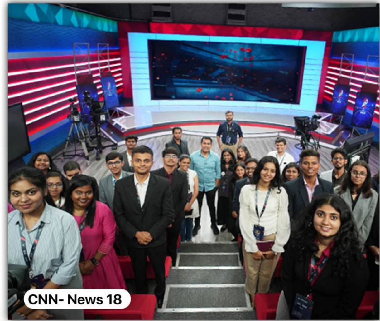
CNN- News 18