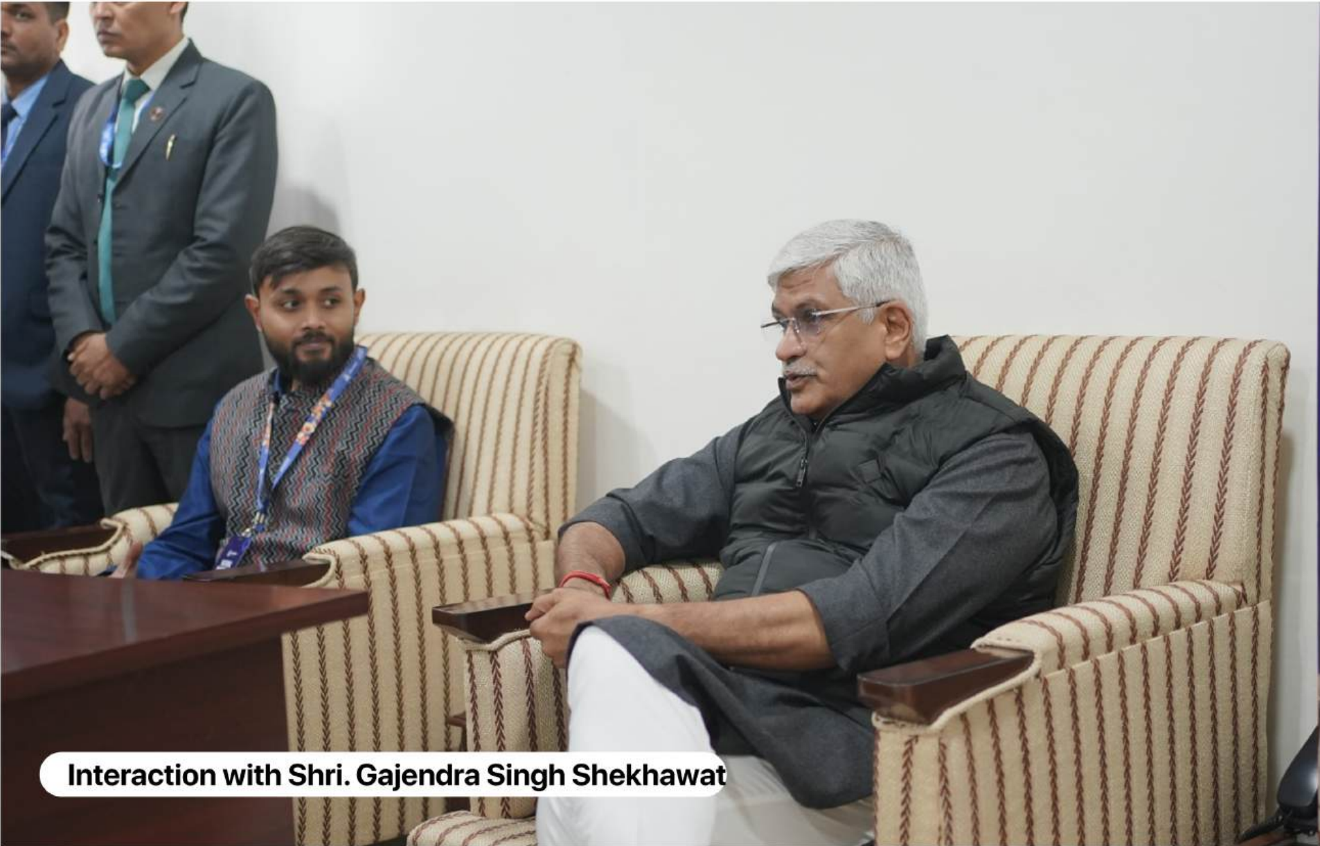
Interaction with Shri. Gajendra Singh Shekhawat