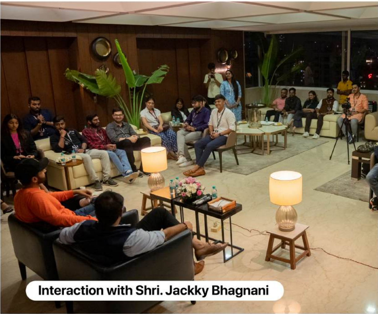
Interaction with Shri. Jackky Bhagnani