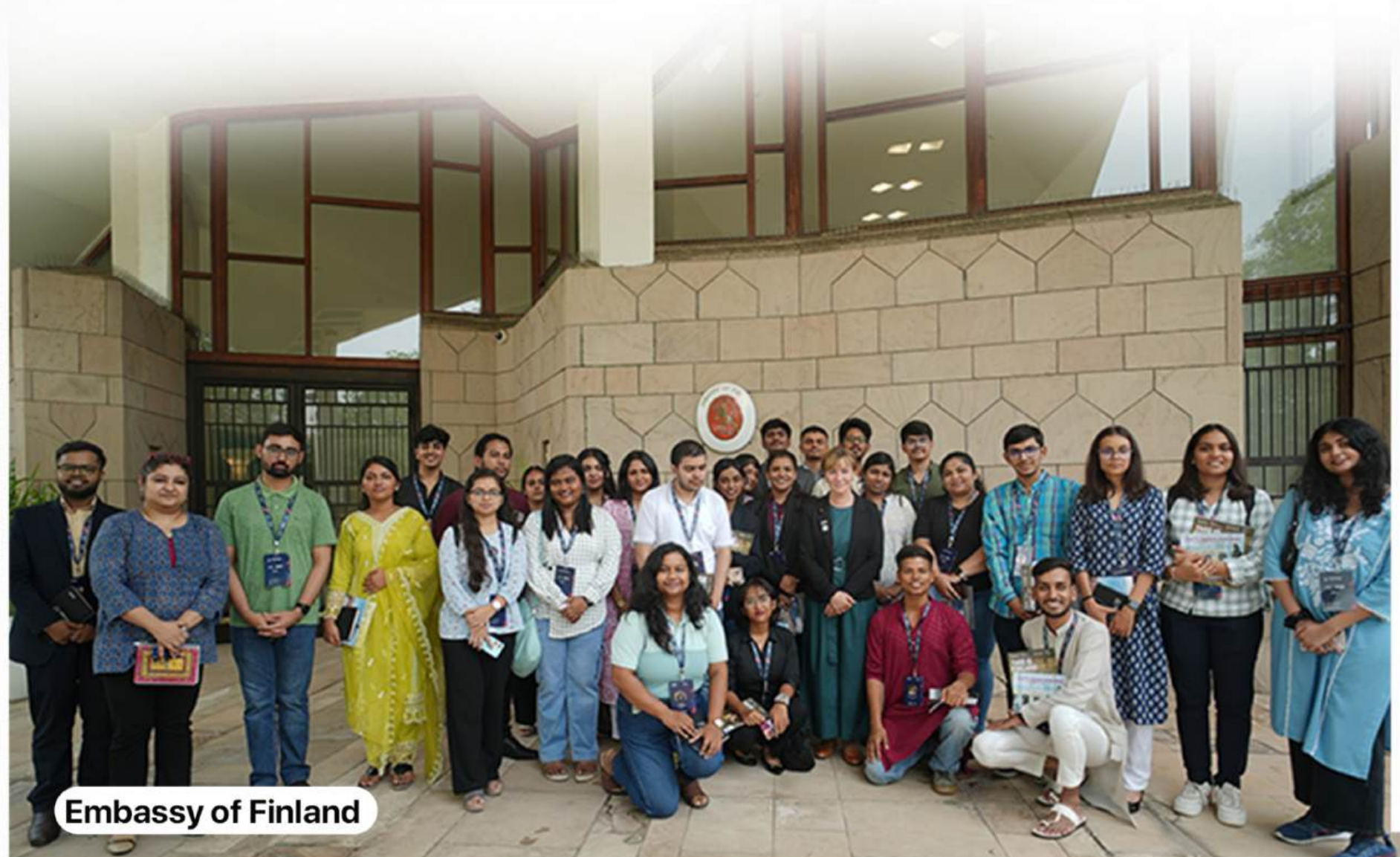
Embassy of Finland