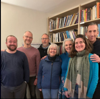
Our trustees for the time they give up to make sure Future Dharma is working at its best and that our grants go to where they're needed most.

We are very grateful to you all. Here is just a small highlight of those we want to rejoice in.