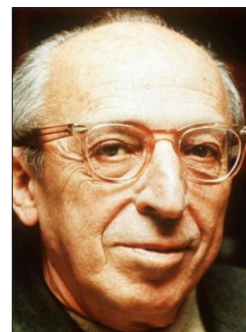
“Rodeo” Composer Aaron Copland

“Colorado really captures that element of ranch life, that time in U.S. history and the centennial state.”