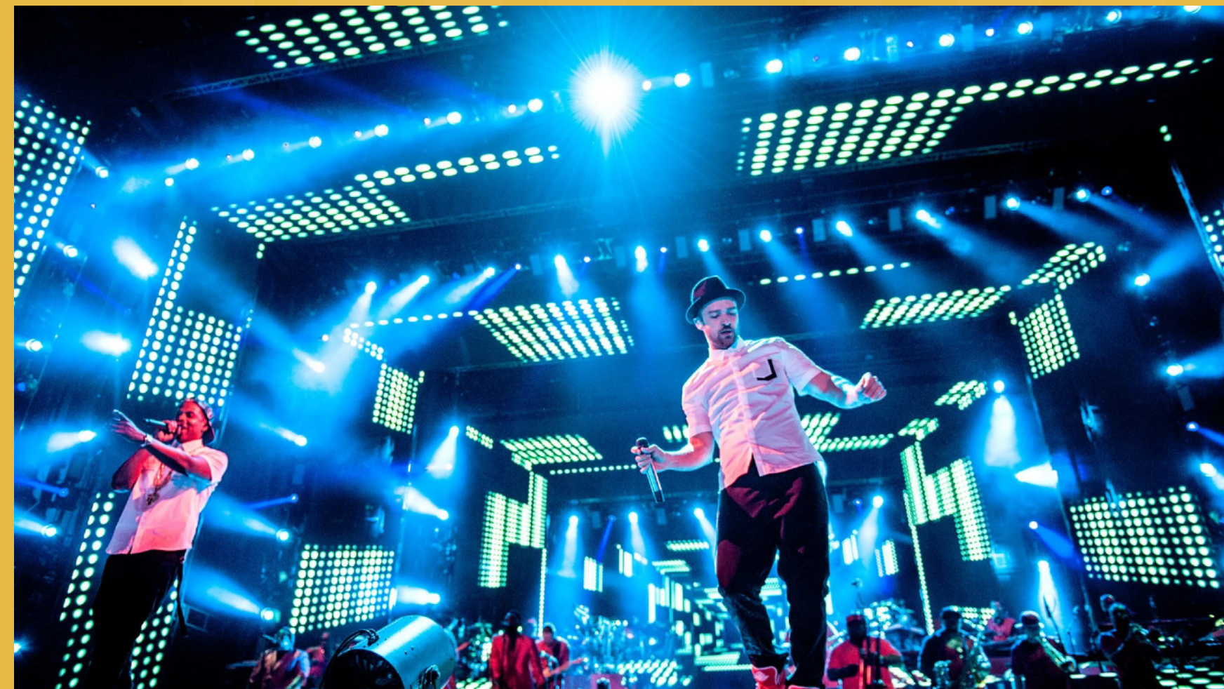
Legends of the Summer Stadium Tour; Jay-Z + Justin Timberlake