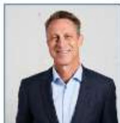
Dr. Mark Hyman, MD, Functional Medicine Doctor

"I have found infrared saunas to be very effective in reducing the stress response and creating balance in the autonomic nervous system. They can improve circulation, help with weight loss, balance blood sugar, and improve detoxification—each of which improves your brain function. I have personally benefited from Sunlighten sauna therapy and feel it can be integrated into anyone's wellness plan."