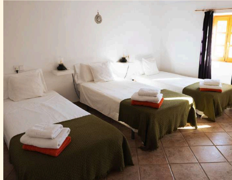
One triple bedroom with 3 single beds

1 private bedroom with a single large bed