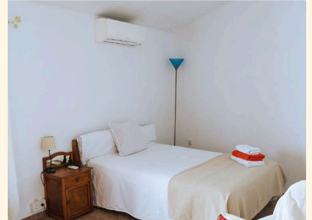
private with terrace