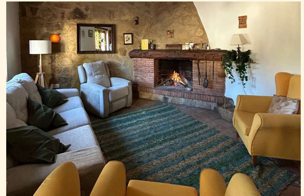
Living room with open fire