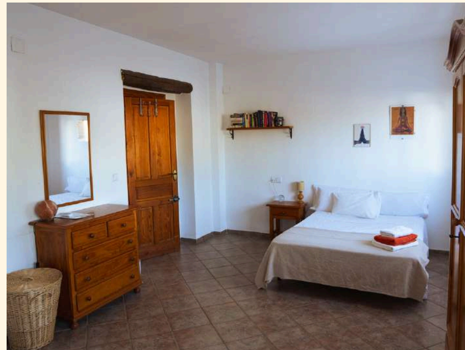
2 double beds in double room