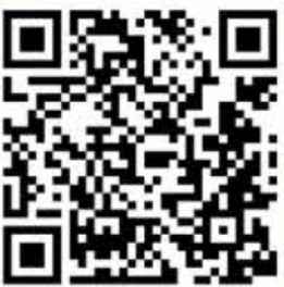
Parkway Learning Center