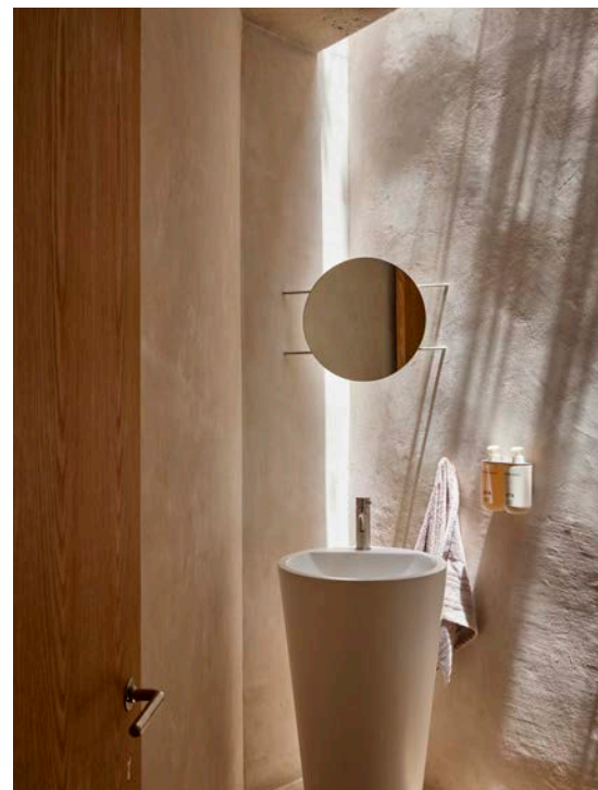
Above While visually unified, spaces are delicately demarcated by the modulation of natural light, from the bright openness of the living area to the cocooned quiet of the bedrooms and the slanting shadows in the guest bathroom. Opposite A partially frosted glass wall invites dappled sunshine into the primary bedroom's en-suite bathroom, which features an Omina bathtub by Boutique Baths.