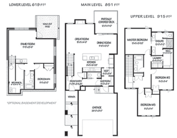
LOWER LEVEL 619 FT² MAIN LEVEL 851 FT² UPPER LEVEL 915 FT²

THE DALLAS 1766 SF 2 STOREY 3 Bed 2.5 Bath