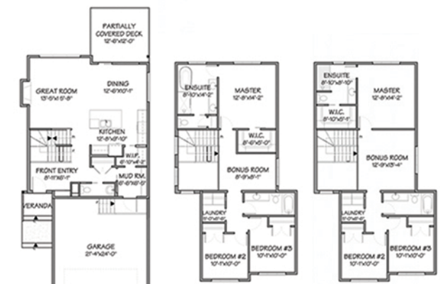
MAIN LEVEL FLOOR PLAN 817 FT2 UPPER LEVEL FLOOR PLAN 924 FT2 OPTIONAL UPPER FLOOR PLAN

THE FINLAY 1741 SF 2 STOREY 3 Bed 2.5 Bath