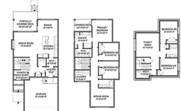
MAIN LEVEL FLOOR PLAN 882 sq. ft. UPPER LEVEL FLOOR PLAN 1,069 sq. ft. LOWER LEVEL 665 sq. ft. Future dev

THE CARSON 1645 SF 2 STOREY 3 Bed 2.5 Bath