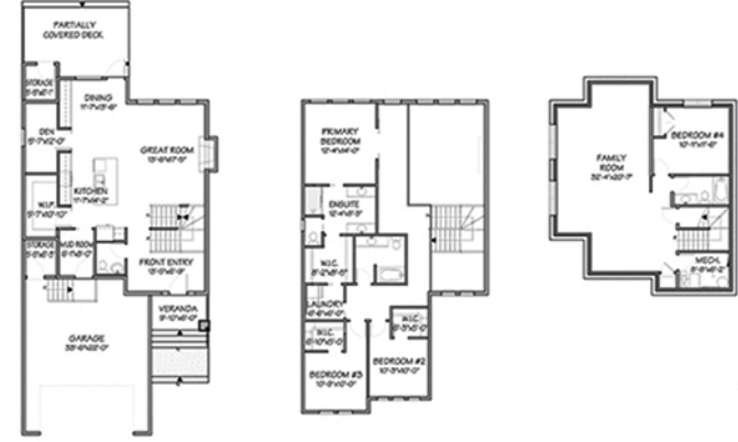
MAIN LEVEL FLOOR PLAN 1,033 sq. ft. UPPER LEVEL FLOOR PLAN 1,099 sq. ft. LOWER LEVEL (OPTIONAL) 809 sq. ft.

THE ANDERSON 2132 SF 2 STOREY 3 Bed 2.5 Bath