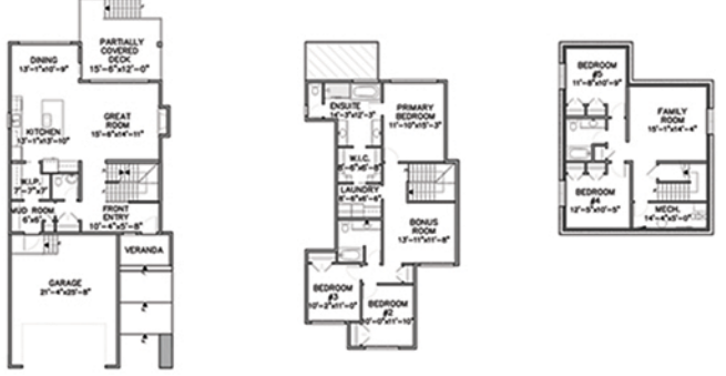
MAIN LEVEL FLOOR PLAN 977 sq. ft. UPPER LEVEL FLOOR PLAN 1,105 sq. ft. LOWER LEVEL 739 sq. ft.

THE GIBSON 2052 SF BI-LEVEL 3 Bed 2.5 Bath