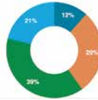
FY26-27 Projected Revenue