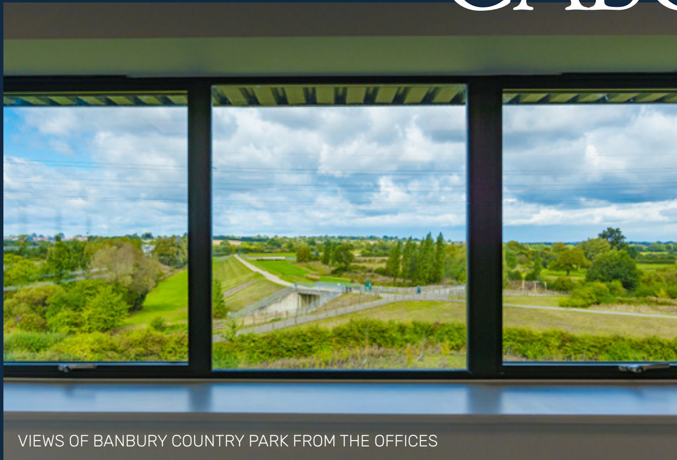
VIEWS OF BANBURY COUNTRY PARK FROM THE OFFICES