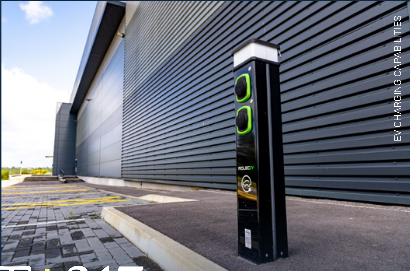
EV CHARGING CAPABILITIES