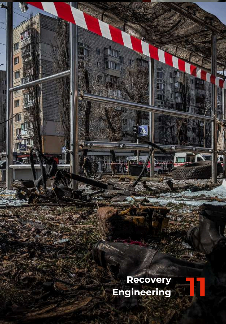
Recovery Engineering 11