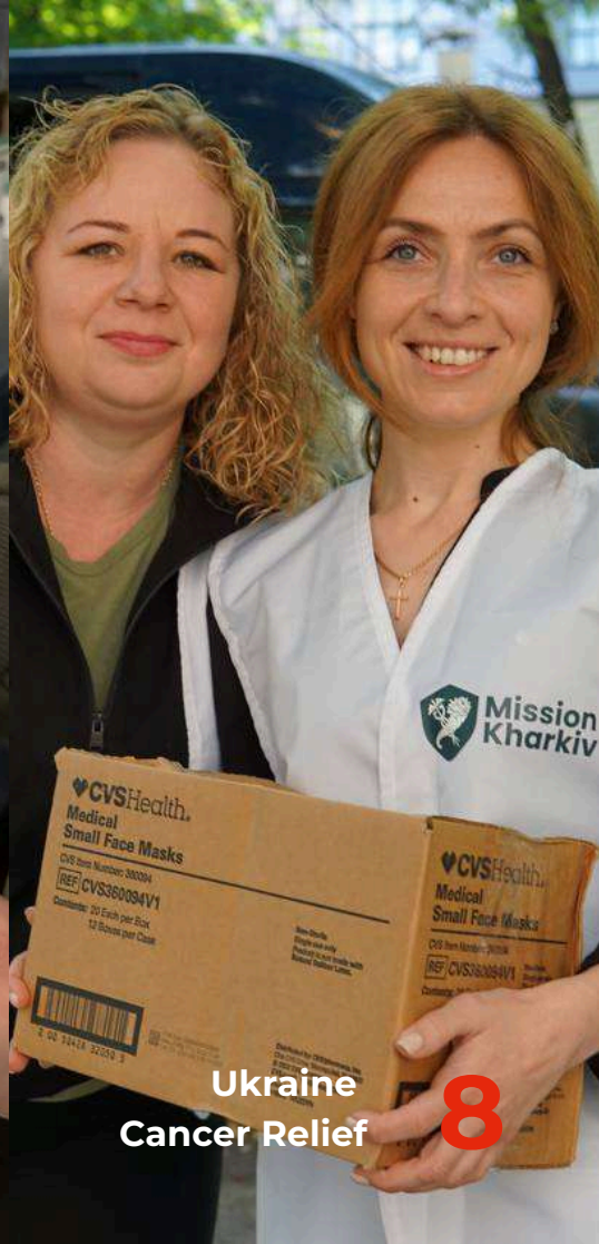
Ukraine Cancer Relief 8