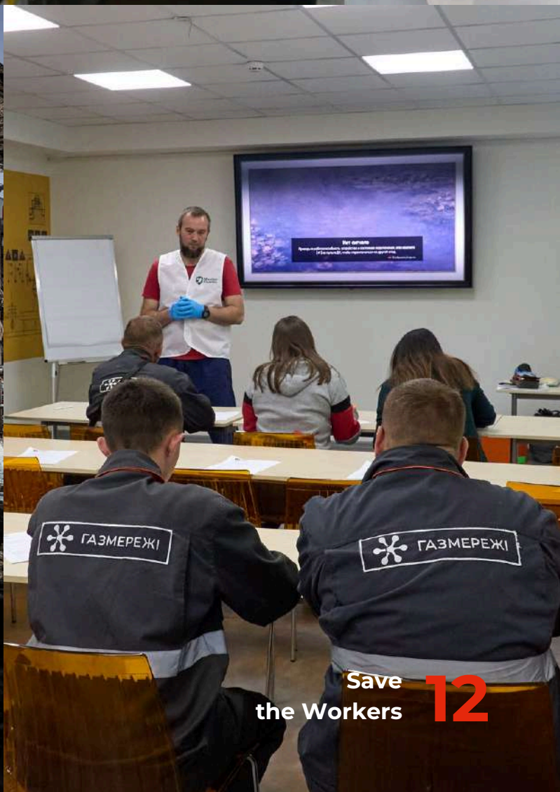
Save the Workers 12