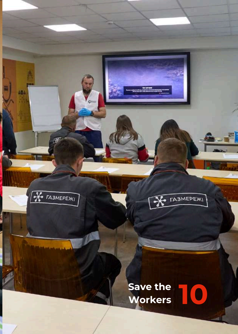
Save the Workers