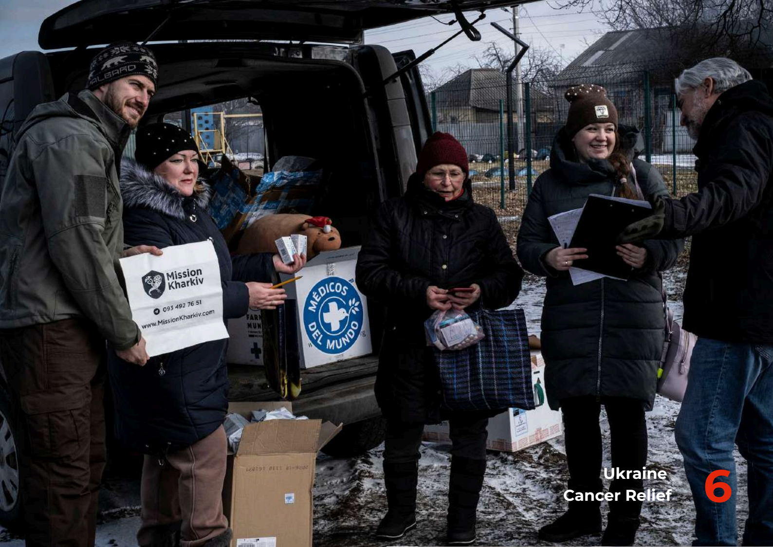
Ukraine Cancer Relief