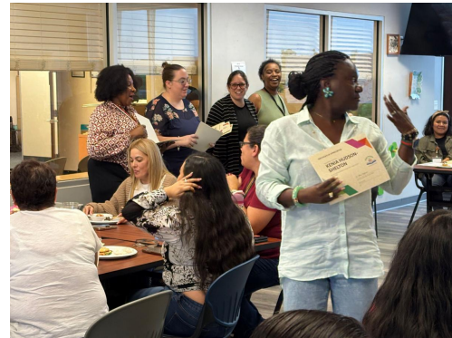
Staff members received certificates marking their years of service at our coalition.