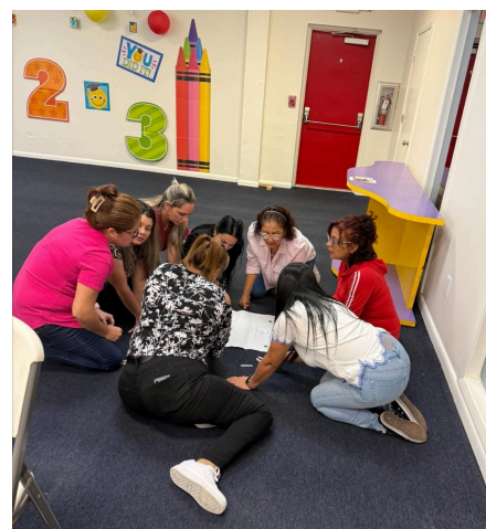
Photo (above): Teachers in a group activity sort and discuss early childhood behaviors as they relate to child development. Photo taken at Right Steps Academy in Fort Myers.

Teachers learned how to recognize a wide range of developmentally appropriate and challenging behaviors that young children may display as they learn social and emotional skills. Recognizing these behaviors helps teachers create positive and supportive learning environments in the classroom.