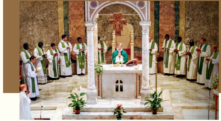
Members of Collegio San Norberto open the school year with Eucharist at the Church of Saint Agatha of the Goths in Rome.

Just as those gathered for the liturgy prepare themselves through prayer from this experience to then listen to God's Word and celebrate the Eucharist, so too may communal prayer prepare communal life to listen attentively to one another and respond, and to live as a community from our mutual gifts - transformed in the Spirit of God.