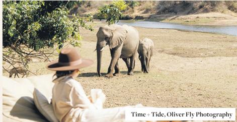
Time + Tide

Start planning: scan the QR code, visit aardvarksafaris.com or call 01980 849160 to talk with a travel expert.