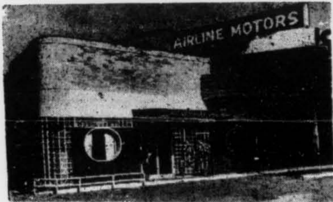
AIRLINE MOTORS: PERFECT SPOT FOR A DRIVING "BREAK"

DOORS ARE OPEN AROUND THE CLOCK TO SERVE OUR FRIENDS AND CUSTOMERS