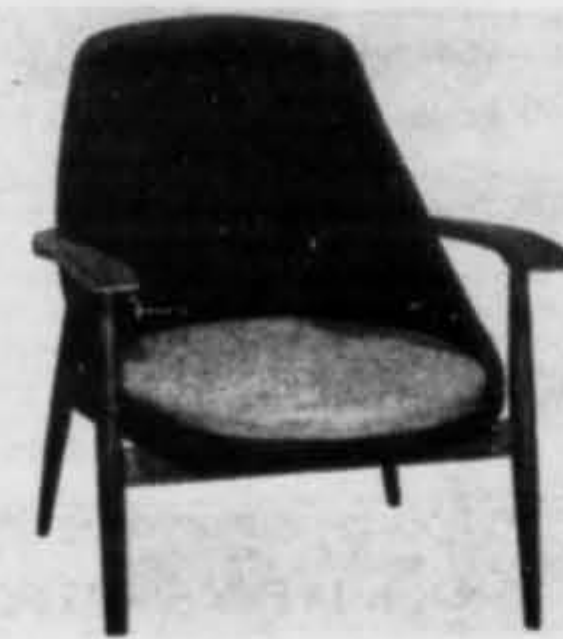
Model FM 109—Metal structure, base in afrosoma, foamrubber stuffing "Pirelli-Sapsa," removable lining. Approx. weights: including packing—overall dimensions: Armchair: 26 lbs. net, 44 lbs. gross; 30 x 33.5 x 30 inches. Sofa: 48 lbs. net; 68 lbs. gross; 30 x 33.5 x 52.2 inches.

Via S. Giovannino 4, Pavia manufactures padded furniture and is one of the largest Italian firms in this field. Here are some samples: