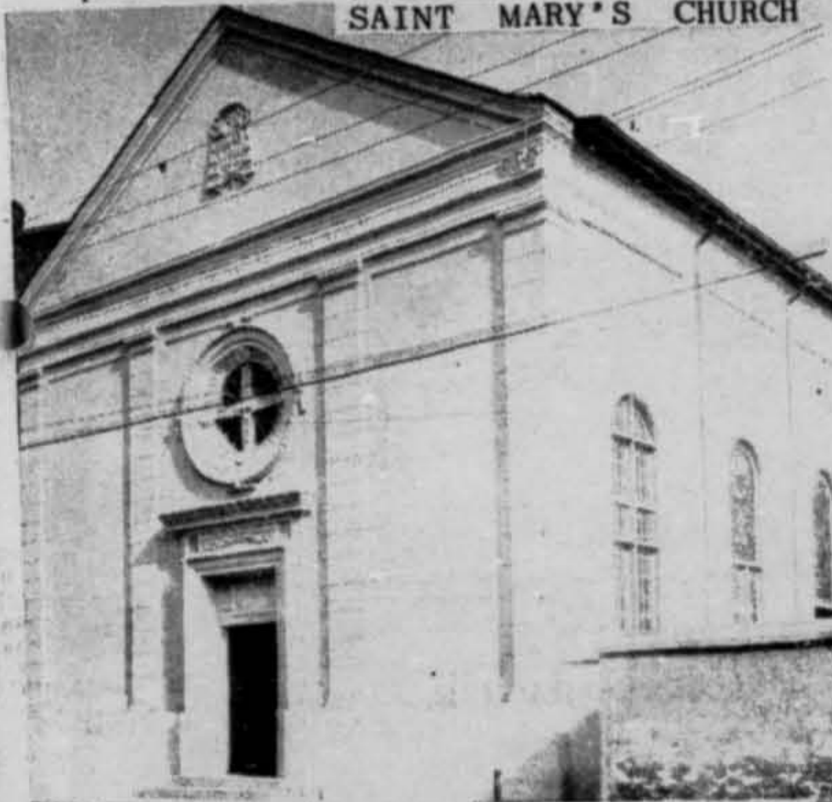
The facade of St. Mary's Church, is simple but impressive. The historic edifice, which is joined to the old Convent, was dedicated in 1845. For decades it was the scene of many impressive ceremonies. Like the Convent it was known as the Church of the Archbishop (Archevoche). Until the turn of the century, St. Mary's was the favorite Church of many Creole families.