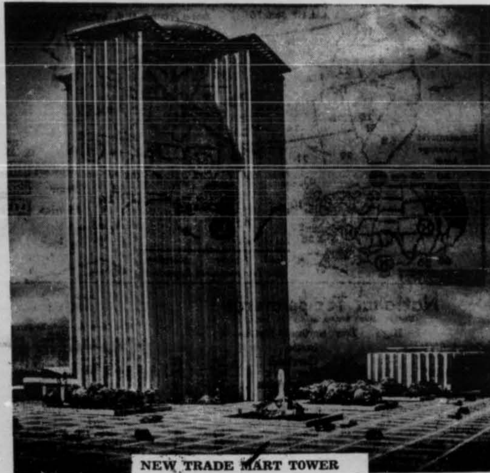
NEW TRADE MART TOWER

The Imposing Structure to be Symbolic of the Port of New Orleans