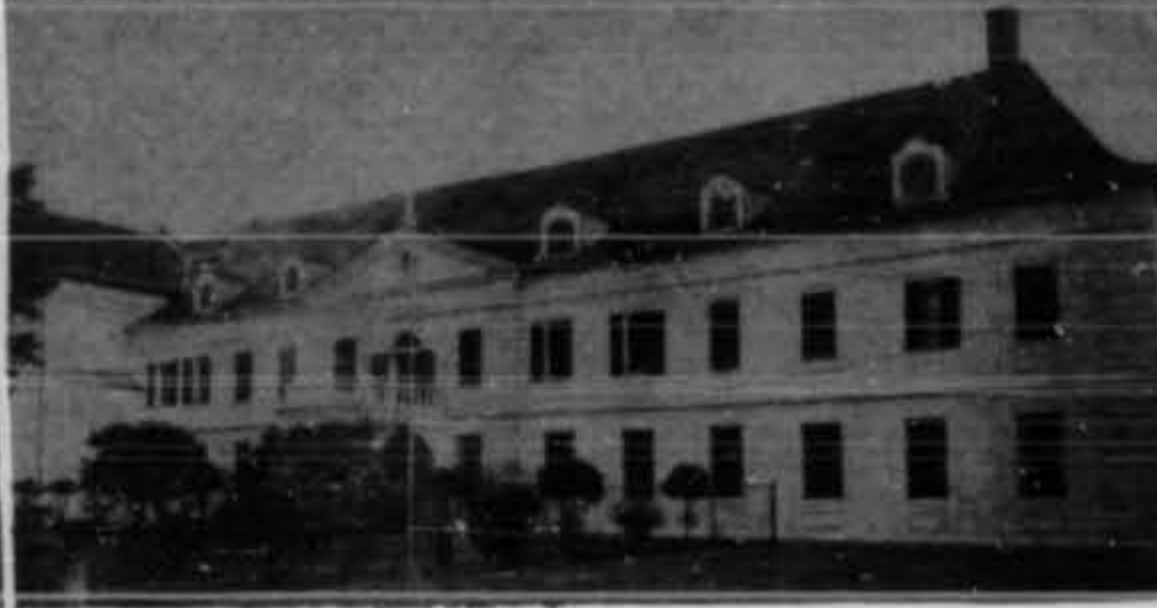
THE OLD URDULINE CONVENT OF NEW ORLEANS AS IT APPEARS TODAY - 230 YEARS AFTER ERECTION

Last month we began this series of articles by using as title: ST. MARY'S ITALIAN CHURCH THROUGH 200 YEARS. Actually this is to be corrected to conform with facts. Only by linking St. Mary's Church to the Ursuline Chapel in the Convent occupied in 1753, we find some justification in the time element since St. Mary was dedicated in 1845. It was called St. Mary's Italian Church in 1919 and although it is still known as such, its designation is now simply ST. MARY CHURCH. It was the year 1727 when work began for the construction of a convent for the Ursuline nuns, who arrived from France on board LA GIRONDE. Their journey began on February 22, 1727 and they reached the mouth of the Mississippi river on July 23, 1727. This must have been a very trying voyage lasting as it did over 150 days. It is indeed a credit to the courageous missionary nuns who had volunteered to come to N.O. From the mouth of the Mississippi it required another 10 days to arrive at the City. They were welcomed by Governor Perier and the Jesuit Fathers as the first group of nuns to establish themselves in American territory.