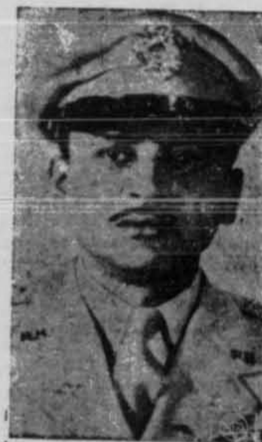
Col. Osvaldo Lopez Arellano

Me siento íntimamente complacido por el amplio respaldo que han brindado al Gobierno Militar todos los sectores sociales del país. El pueblo hondureño ha interpretado fielmente las finalidades perseguidas