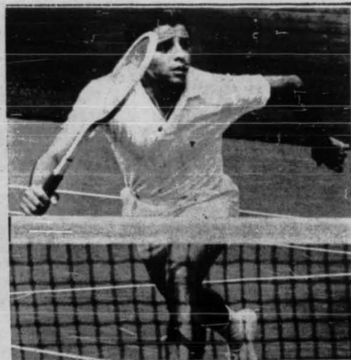
Rafael Osuna, No. 5, won Forest Hills and beat McKinley in the Davis Cup American Zone tie.