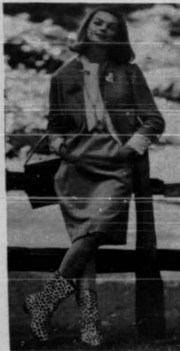
... the country look

You can make this especially designed suit, with Chanel touches, in fabrics to suit your fancy for city, country or elegant occasions. Like the pattern? Send 75¢ to: Pattern Offer, Dept. 4, P.O. Box 888, St. Louis 88, Missouri. Be sure to state your size —10, 12, 14 or 16.