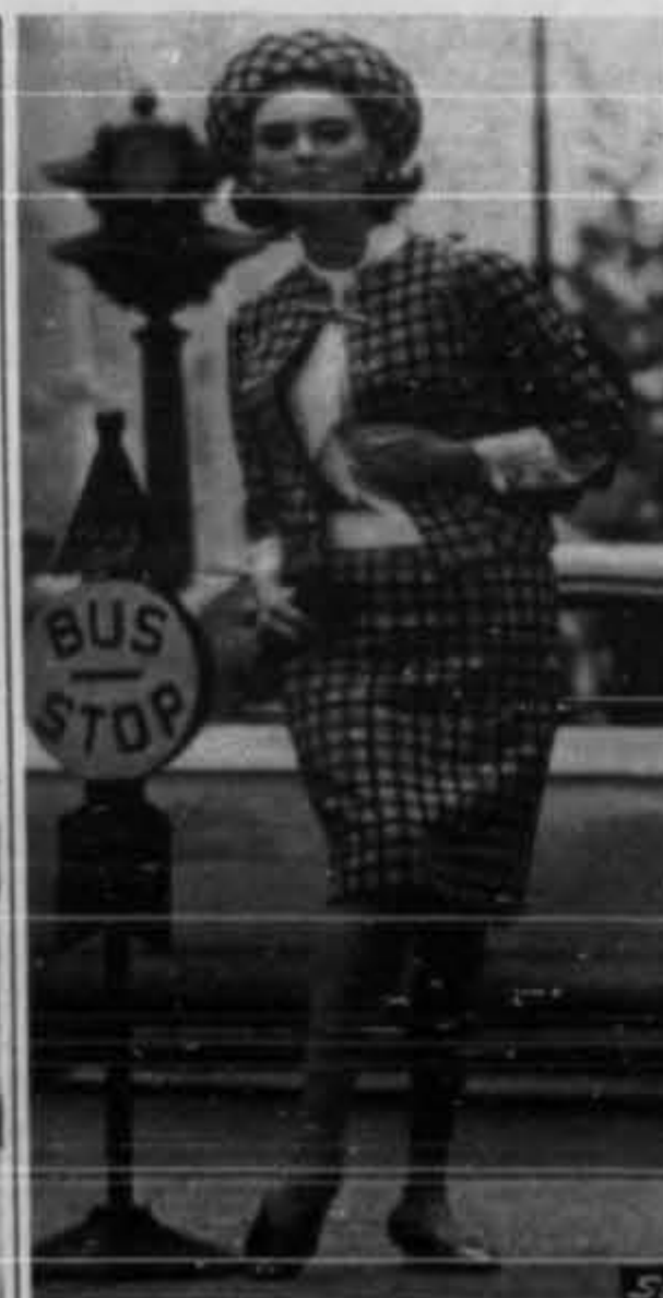
... the city look

Are you among the millions who sew your own "originals?" Then you know that a slender figure is your best fashion asset. If your figure doesn't quite fit your fashion, let SEGO Liquid Diet Food help you cut calories. Lose a few pounds with a liquid diet meal a day. Avoid diet monotony with different flavors. One day choose chocolate malt,