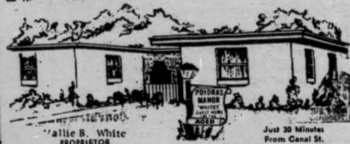
Allie B. White PROPRIETOR