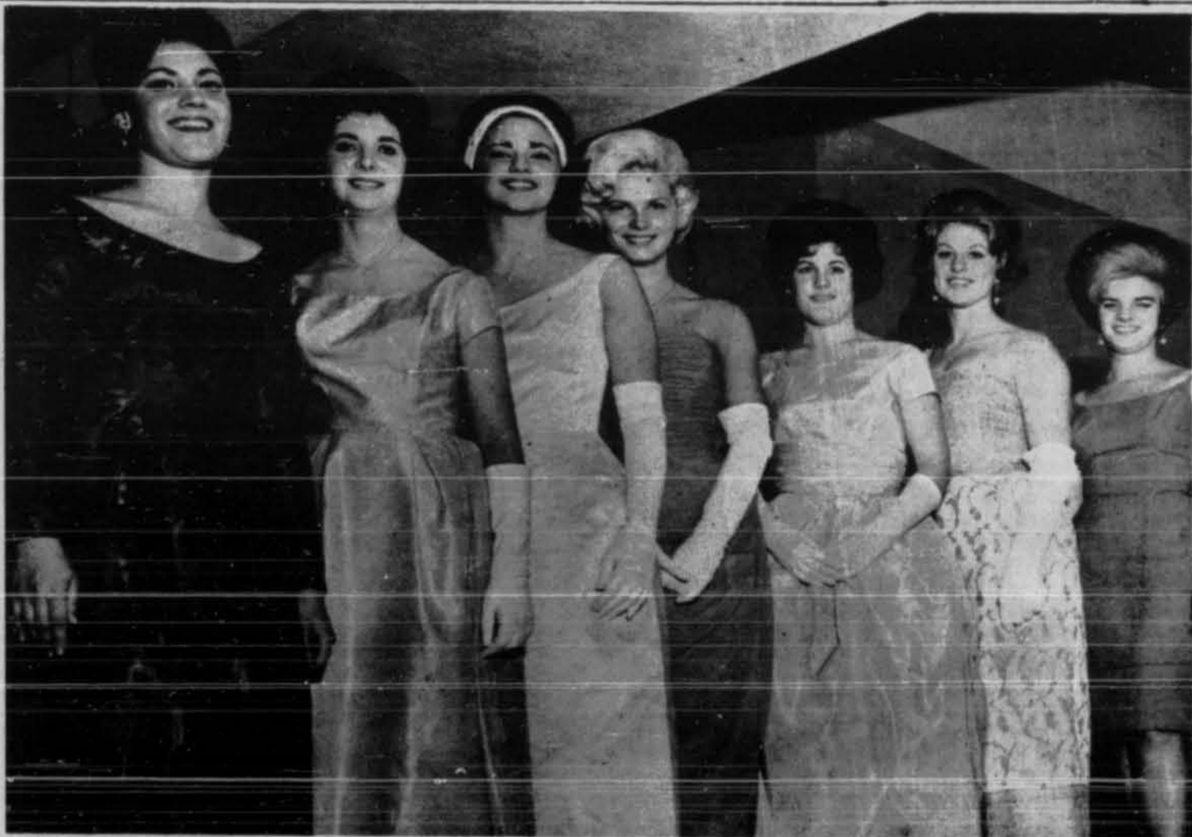
Bellezze di Philadelphia. — Una di queste graziose e sorridenti ragazze sarà "Miss Columbus Day" del 1963. la loro scelta, per partecipare alla fase finale della gara, da tenere il 4 ottobre nella sala-bar della "Casa dei Figli d'Italia" in Broad e Federal St., è stata deliberata

dovuto soccombere davanti alla serenita' della sua morte. E' spirato senza paura, e chi gli dava tanto coraggio? Certo, glielo ha dato Colui che deve esistere. Perdonami, caro Papa Roncalli, caro mio conterraneo bergamasco. Io non ti ero mai stato amico, ma la tua agonia e la tua morte mi hanno fatto ripensare un po' a tutto, sconvolgendo la mia coscienza. E cosi ho pianto quando ho sentito la notizia che eri spirato, sebbene tutti sapessimo che la morte era inevitabile, e che era anzi un sollievo per le tue sofferenze. Io non ti ho mai seguito, Papa Giovanni, non ho mai ascoltato le tue parole. Ora, in qualunque luogo tu sia, ti prometto che seguiro' il tuo esempio e ti rivolgero' le preghiere che mi ha insegnato mio figlio nel giorno della tua morte. Benedici questo mio ragazzo, Santo Padre, aiutalo sempre. Con le lacrime agli occhi ti chiedo, buon Papa Giovanni, di farlo vivere come te. E quando anch'io saro' chiamato all'ultima ora, fammi morire come te.--