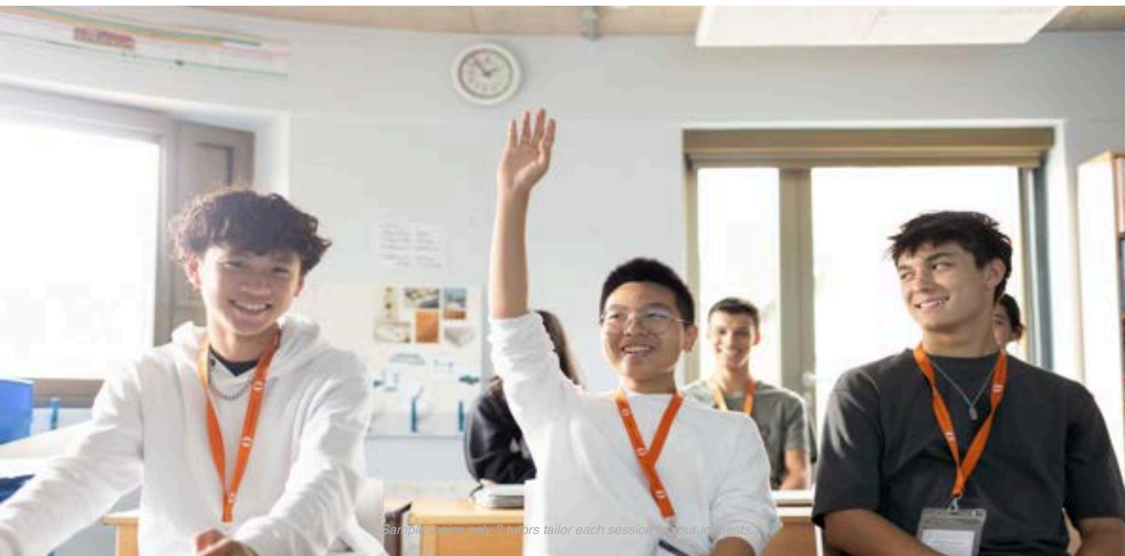
Sample topics only? tutors tailor each session to your interests.