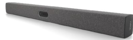
Neat Bar Pro