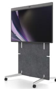
Neat Board Pro (with adaptive stand)