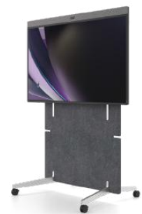
Neat Board Pro (with adaptive stand)