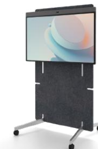
Neat Board 50 (with adaptive stand)