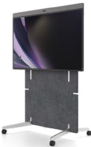
Neat Board Pro (with adaptive stand)