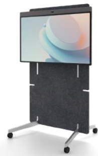
Neat Board 50 (with adaptive stand)