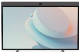
Neat Board 50