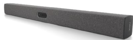
Neat Bar Pro