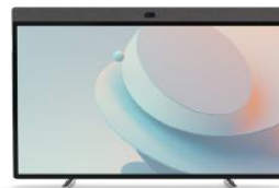
Neat Board 50