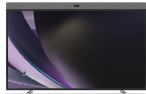
Neat Board Pro