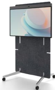
Neat Board 50 (with adaptive stand)