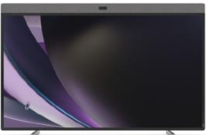
Neat Board Pro