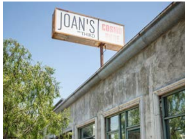
JOAN'S ON THIRD