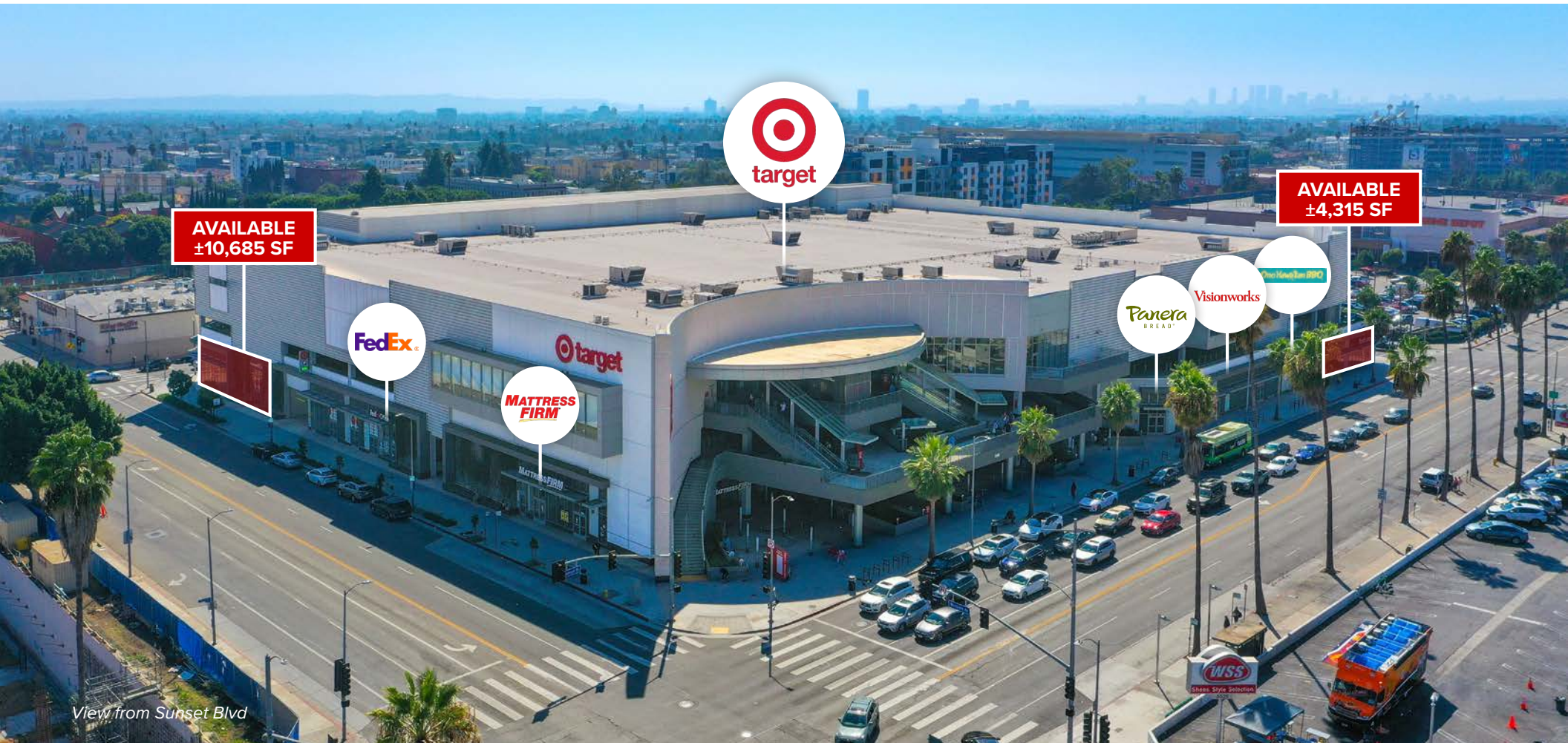
View from Sunset Blvd