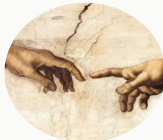
Michaelangelo - The Creation of Adam

"With all humility and gentleness, with patience, bearing with one another through love, striving to preserve the unity of the spirit through the bond of peace: one body and one Spirit, as you were also called to the one hope of your call; one Lord, one faith, one baptism; one God and Father of all, who is over all and through all and in all." (Ephesians 4:2-6)