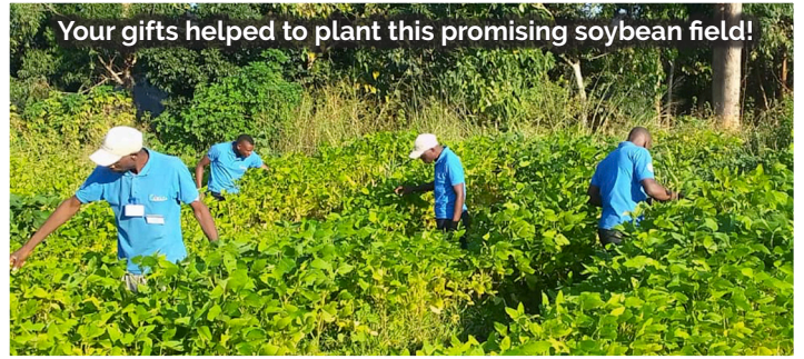
Your gifts helped to plant this promising soybean field!

soybean crops have thrived, even outside the typical planting season. The soil’s natural fertility seems to be playing a key role. We’re keeping a close eye on the crop’s progress, and it’s looking promising!