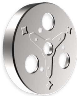
Steel Drum for Live Axle