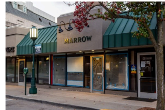
Marrow plans to open its Birmingham location in December.

The four-time James Beard-nominated restaurant and butcher shop in Detroit is branching out with a new location in Birmingham at 283 Hamilton Row . The new location will feature café-style seating and a casual menu that will include Marrow's bacon burger, deli sandwiches, and breakfast sandwiches — available for dine-in or pick-up. There will also be a market carrying Marrow's signature meats, aged steaks, deli items, wine, and more. Marrow is also in the process of building a new restaurant, flagship store, and meat processing facility in Eastern Market, which it expects to complete next year.