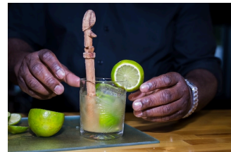
Miss Eva's plans to have its grand opening in spring 2025.