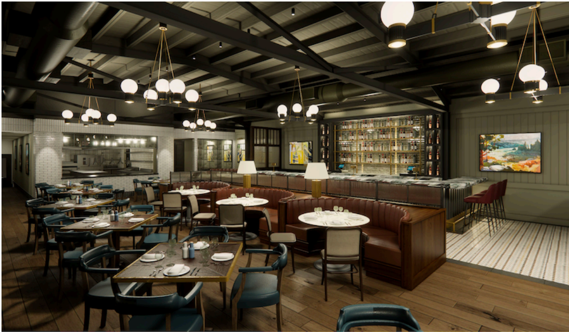
Rudy's Prime Steakhouse opened recently in the historic Rudy's Market building in downtown Clarkston. // Photo courtesy Rudy's Prime Steakhouse