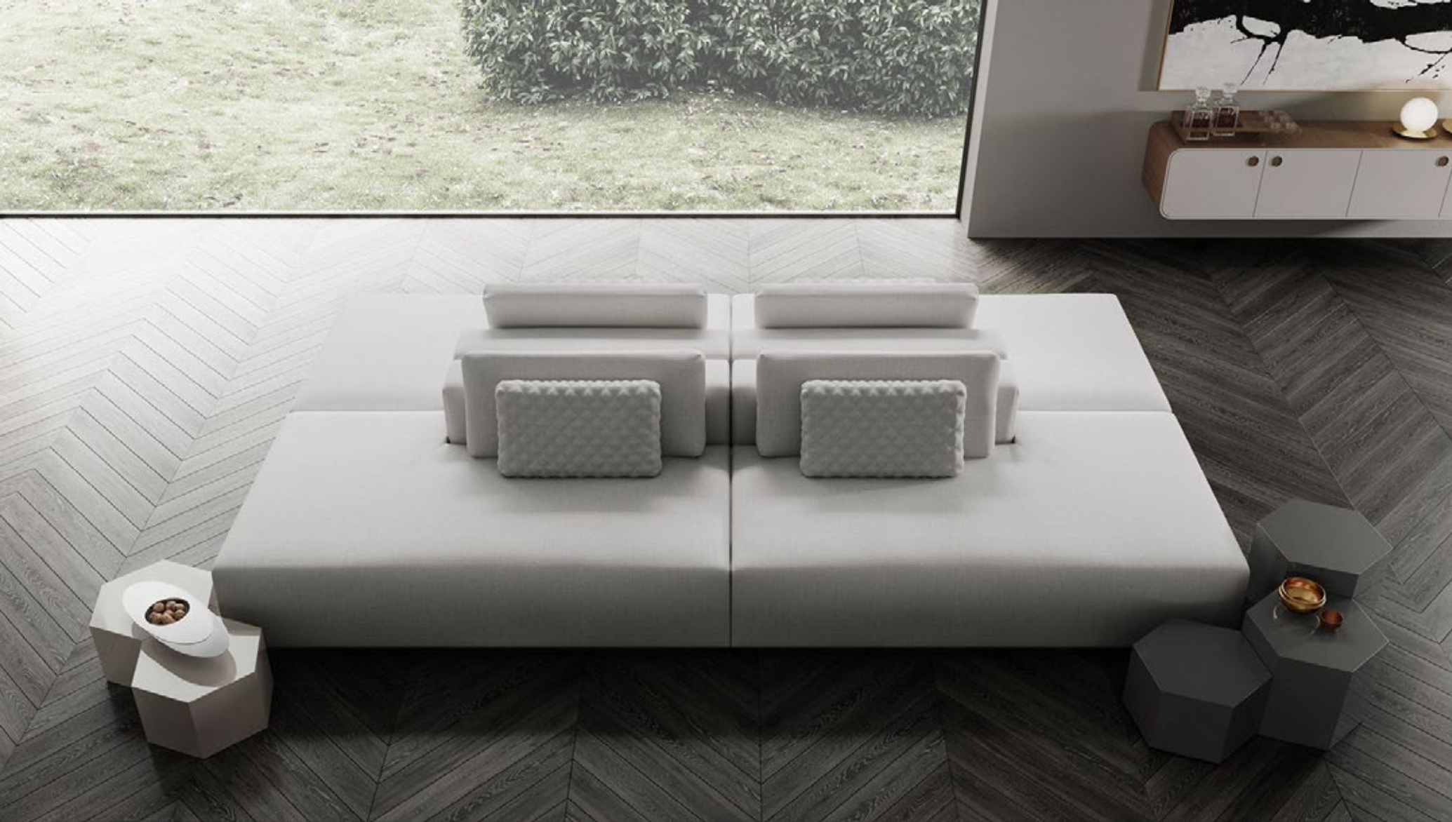
FURNITURE SET MODLOFT