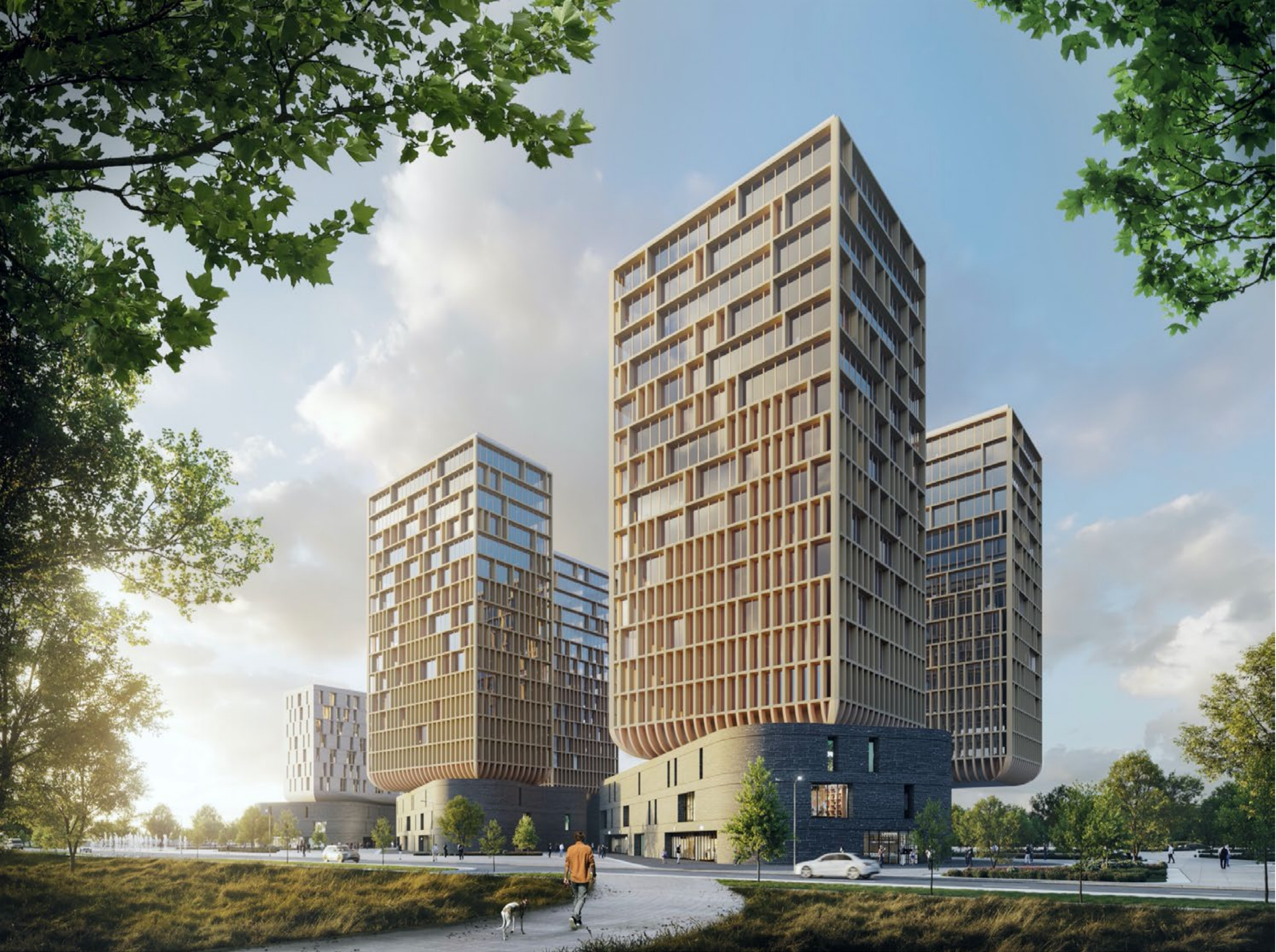
BUSINESS EXPO CENTER BI-GROUP NUR-SULTAN, KAZAKHSTAN