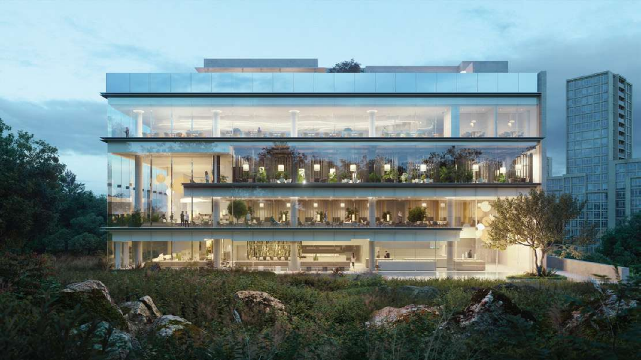
ANARKH PROJECT SIMPLEX ARCHITECTURE SOUTH KOREA