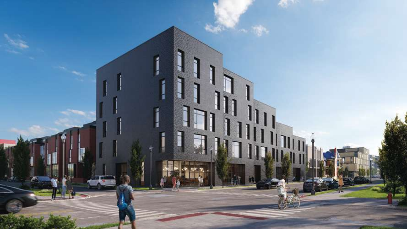
CITY MODERN ZOYES CREATIVE STUDIO USA