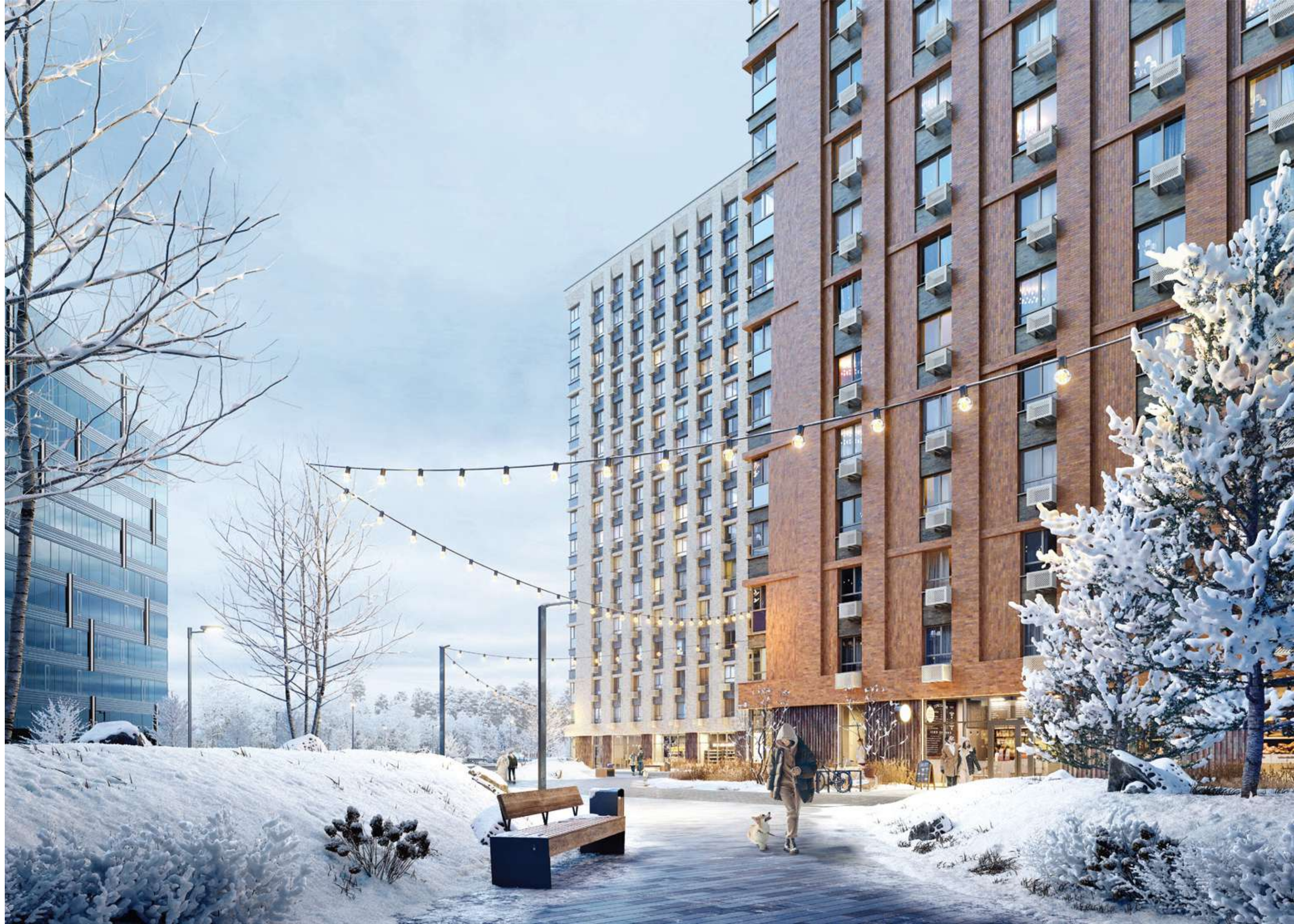
TOPAREVO PARK SAMOLET RUSSIA