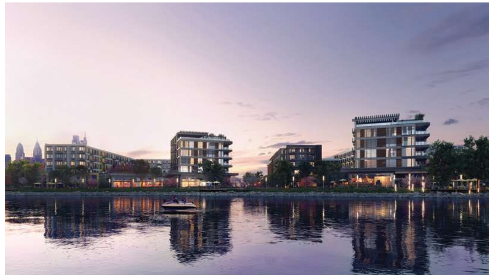
FESTIVAL PIER BERNARDON USA