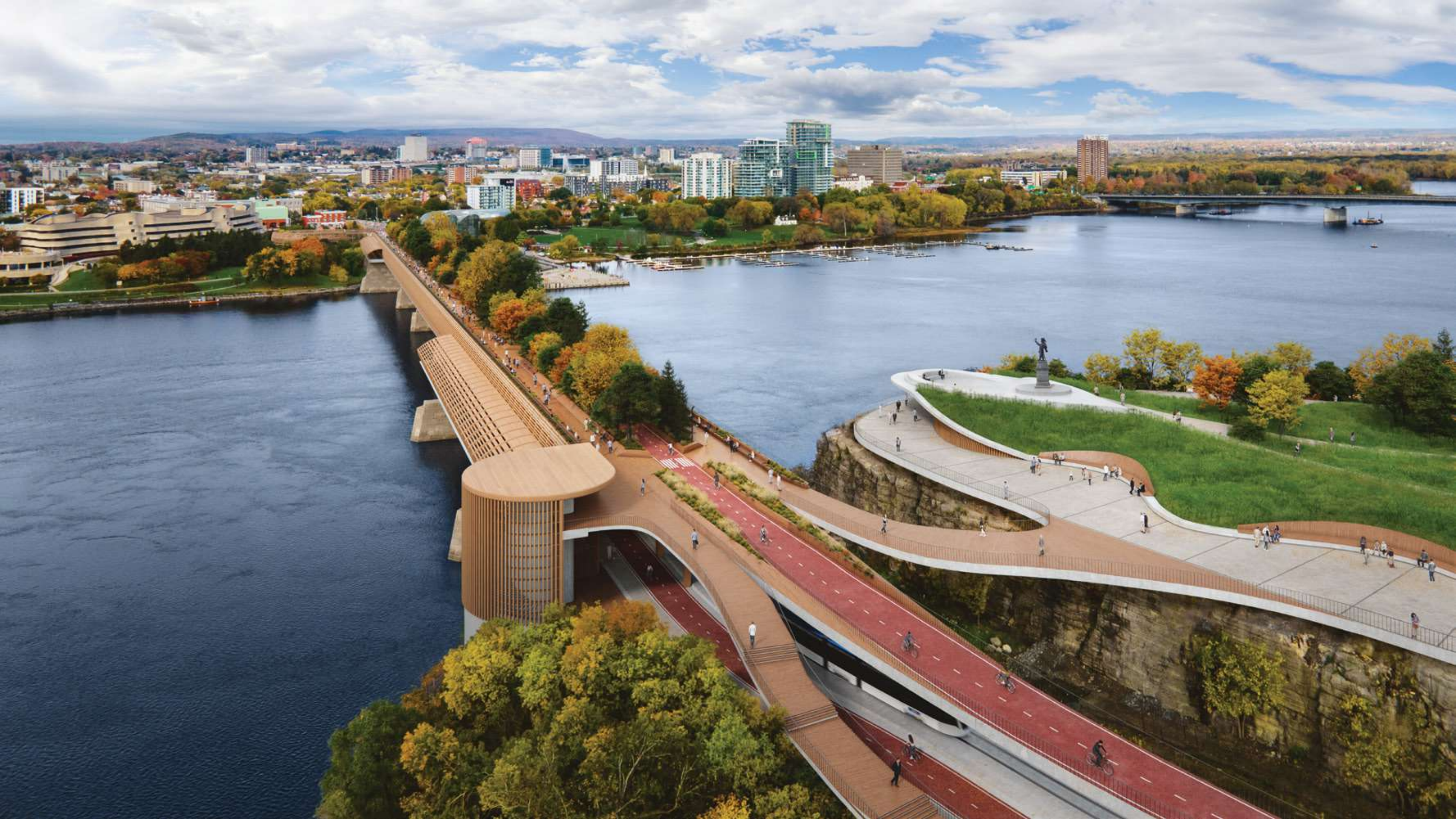
ALEXANDRA BRIDGE ATELIER DES JARDINS CANADA