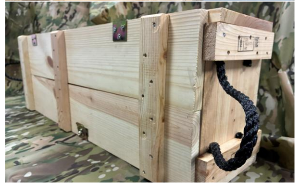
Cage 3CKP5 UEID ZJ2JHZU9XQB9

321920 - Wood Container & Pallet Manufacturing