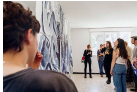
Students École des Beaux Arts, Sète

Mirroring the ceramic fresco, a diurnal evocation linked to the return of light, this composition in indigo ink invokes natural forces linked to aquatic and lunar space. The title refers to the river in the paper-making village of Kurotani, in the mountains near Kyoto, which has been making washi from the bark of the kozo (mulberry) tree and the river water for 800 years. The artist set off to learn the techniques used to make this paper during the summer of 2023. Using the indigo used to dye washi, she is painting a mythology of this river and is currently preparing a new residency in Japan. She is interested in this traditional handcraft in harmony with nature, and is working on suspended installations that show the materiality of paper.