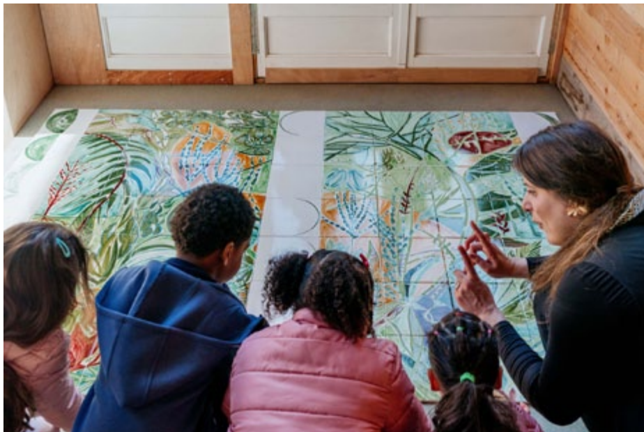
schoolchildren from Eugénie Cotton