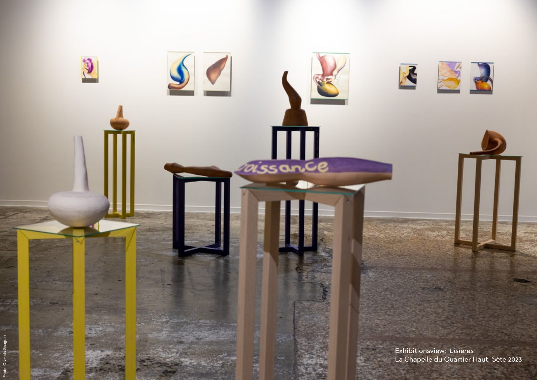
Exhibitionsview: Lisières La Chapelle du Quartier Haut, Sète 2023