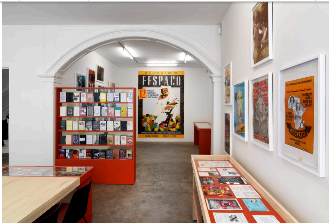
PerAnkh @Raven Row.